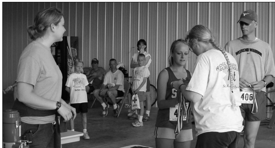
The Ridge Volunteer Rescue Squad sponsored a 5K Run/Walk Fundraiser.

Below is a sampling of EMS activities across the state: