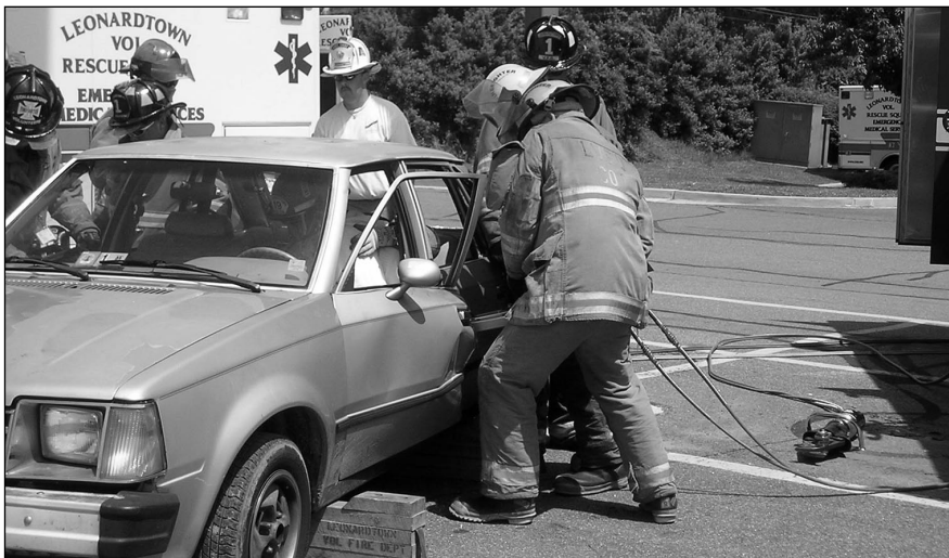
Members of the Leonardtown Volunteer Rescue Squad "pop" the door during an auto extrication demonstration.