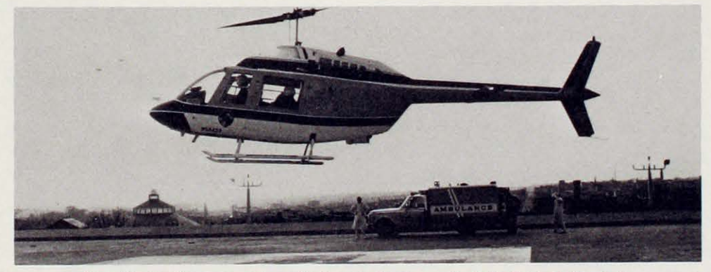
... and provide for the construction of helicopter landing pads at the Region's hospitals ....

In addition to the Regional funds, the Division has received $161,574 to develop statewide programs including: a statewide triage (sorting of patients by severity of injury) system for victims of major disasters anywhere in Maryland; a multi-media audio visual resource center for the advanced training of