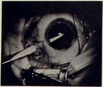
Delicate eye operations are performed at the Eye Centers at Georgetown and Johns Hopkins hospitals. (Right) Eye surgeons operate on a patient at Georgetown University Center for Sight.

The round-the-clock service is aimed at providing care for