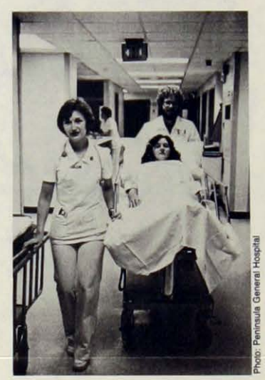
A trauma patient is wheeled to the Admitting Area at Peninsula General Hospital.