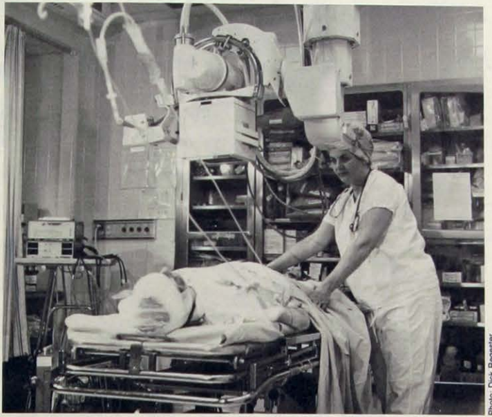
At the areawide trauma center at Suburban Hospital, a patient is readied for X-rays.

Suburban Hospital In Montgomery County a driver loses control and crashes into the back of another vehicle. The second car bursts into flames. Montgomery County paramedics arrive and quickly assess the victims. The driver of the first car has suffered critical injuries while the second driver is severely burned. A Maryland State Police Med-Evac helicopter is dispatched; communications are established with the Areawide Trauma Center at Suburban Hospital; MAST Trousers are applied; IVs are started; injuries are stabilized. The trauma patient is taken to the Areawide Trauma Center at Suburban Hospital, while the burn patient is loaded on a helicopter for the quick trip to a specialty referral center for burns and his less seriously injured friends are taken by ambulance to the nearest hospital. The areawide trauma center, specialty referral center, and hospital emergency department are alerted before the patients arrive and are ready to provide the appropriate care.