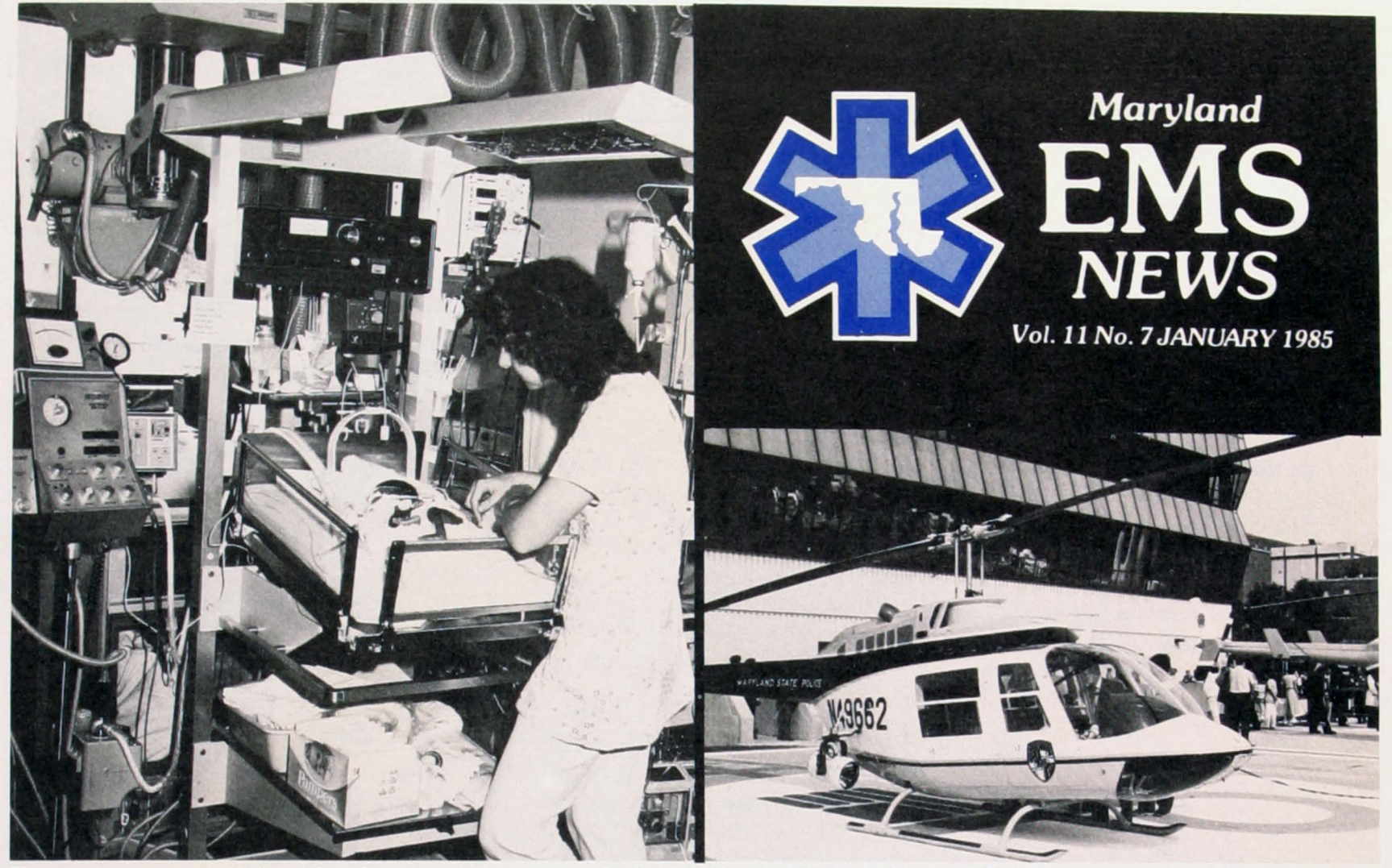
The neonatal center (left) and pediatric trauma center at Children's Hospital National Medical Center were recently designated as part of the Maryland EMS system. Some patients from Maryland are transported via Maryland State Police Med-Evac helicopter to the heliport at Children's Hospital (right).