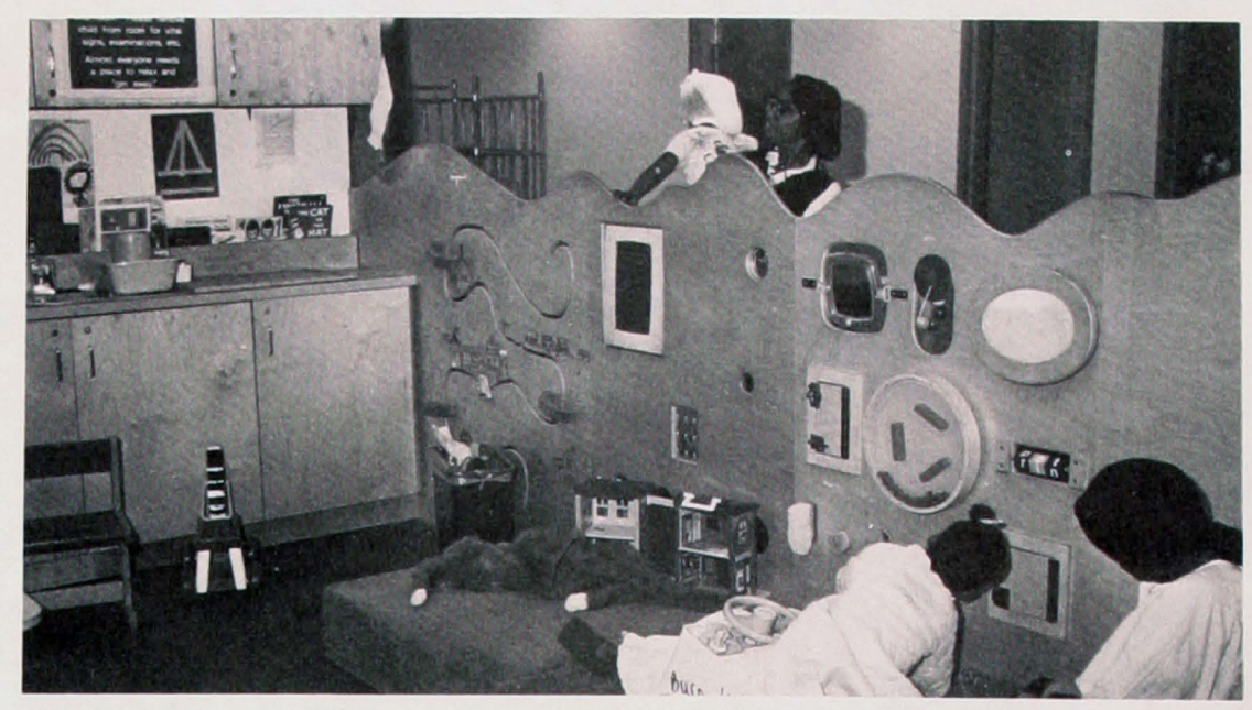
Patient in playroom of the burn unit at Children's Hospital. To keep the playroom a happy place, a sign says, "Thank you for not doing medical procedures in this room. Please remove child from room for vital signs, examinations, etc. Almost everyone needs a place to relax and 'get away."