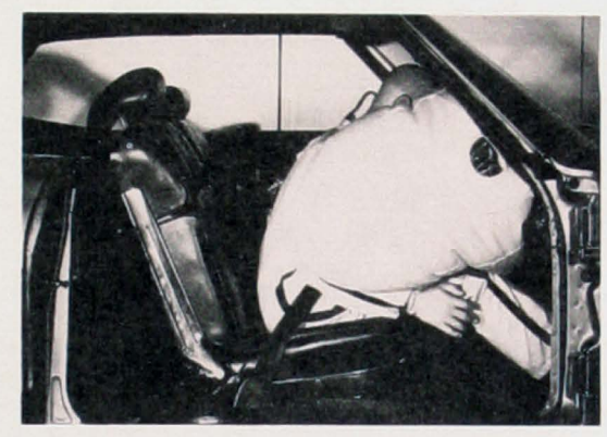
An airbag is located in the dashboard or steering column of a car. In a front-end collision, the airbag inflates instantly to prevent the driver and passengers from hitting the windshield or dashboard. It inflates and deflates so rapidly that people involved in accidents are hardly aware it has operated.

Every day of the year, there are approximately 120 Americans killed in automobile crashes, a total of 43,584 people last year — more deaths than the entire Vietnam war. It is estimated that 8,000 lives a year could be saved if all cars were equipped with passive re-