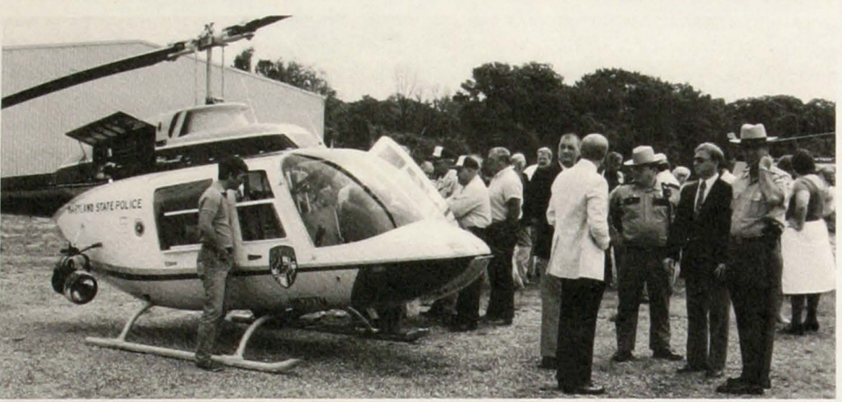
A large crowd attended the dedication of the new MSP med-evac helicopter in Centreville.

During the past years the number of med-evac calls from this area has been