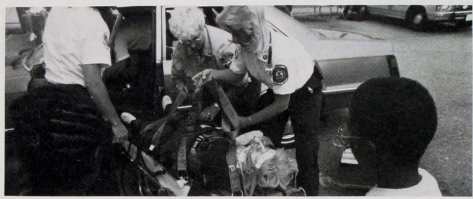
Extrication and patient care techniques were demonstrated on a mannequin in a vehicular crash scenario.