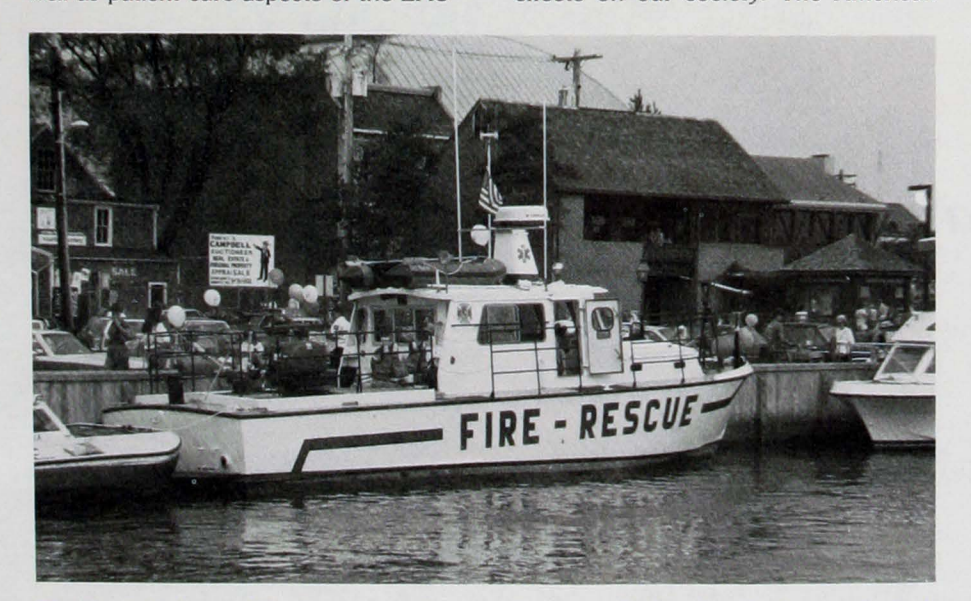
The Deale Volunteer Fire Department's rescue boat was displayed at the Annapolis dock during EMS Day '86.

The American Trauma Society's booth at EMS Day '86 described their mission of mobilizing public support to meet the challenge of trauma: to arrest the causes of senseless, needless injury and death. The society was established in 1968 as a nonprofit health organization composed of individual and organizational members. Its goals include promoting trauma awareness and prevention through national public information programs, developing and providing emergency medical information and training programs for the general public and EMS trauma professionals, and educating legislators about trauma and its effects on our society. The American