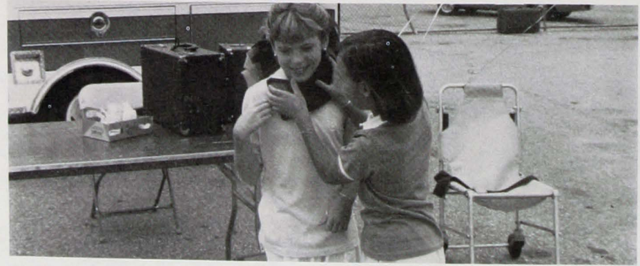
The public could gain first-hand experience with prehospital care equipment at booths sponsored by fire and rescue companies.