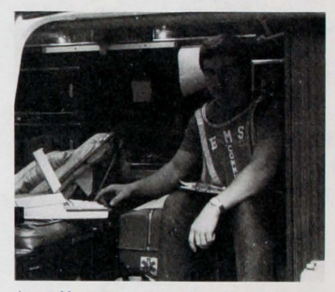
A portable computer system is used to track patient transports.

The first call for emergency assistance was issued by Allegany County Civil Defense at 2:15 pm. EMS personnel who were first to arrive at the scene assessed the extent of the incident and immediately called for additional assistance. To add to the tension and realism of the response, the organizers of the drill timed the events to cause the path of arriving units to be blocked by a train passing near the fairgrounds; they were delayed for several minutes.