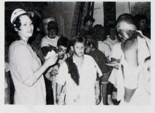
Prior to the disaster exercise, school children are moulaged to simulate various injuries.