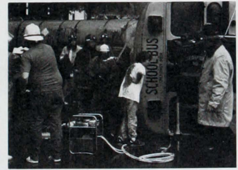
Extricating "victims" from the overturned bus.

Prehospital care and patient transport were provided by five ambulance companies: Corriganville, Cumberland City, Flintstone, Frostburg, and La Vale. Patients were taken to Cumberland Memorial, Frostburg, and Sacred Heart Hospitals. Participating fire departments were from Cresaptown, Bowling Green, and Bedford Road. Personnel from the Maryland State Police were also involved in the drill; the scenario included the use of a Med-Evac helicopter, but inclement weather prevented its arrival.