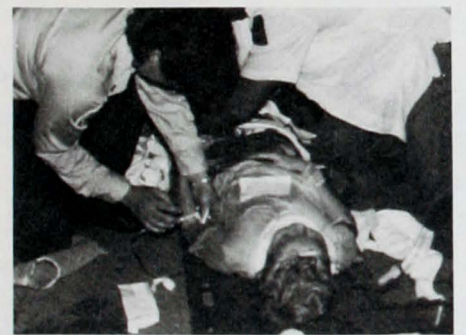
Prehospital care at the mock disaster.