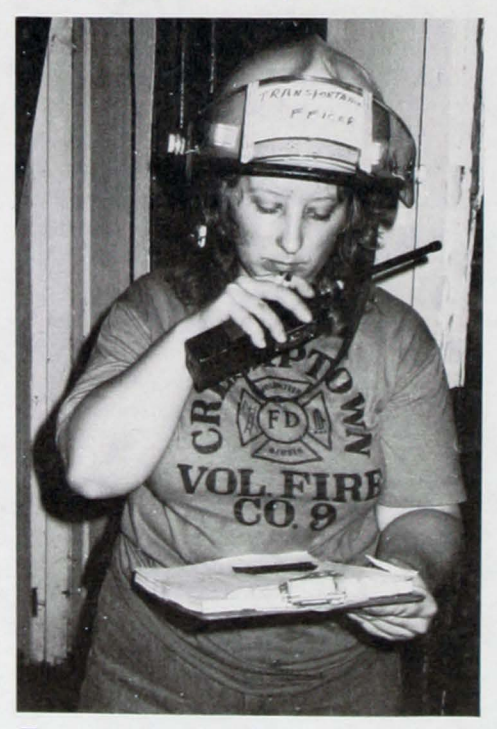
The transportation officer directed the transport of 36 patients by five ambulance companies.