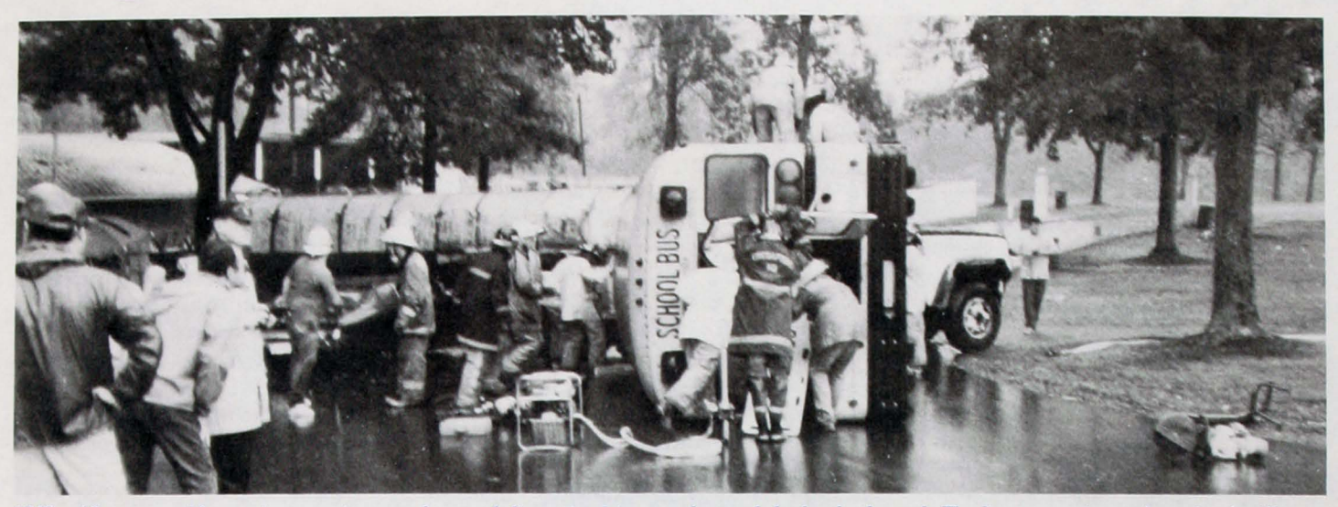
EMS and fire personnel from various agencies respond to a mock disaster involving an overturned school bus that had been struck by a tractor-trailer. A car had also

become lodged under the truck. The disaster exercise was located at the Allegany County Fairgrounds.