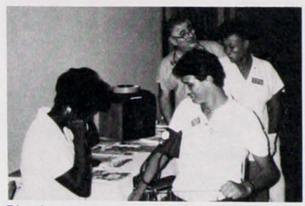
Blood pressure screenings were offered to the public at Southern Maryland Hospital Center.