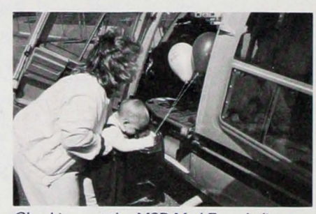
Checking out the MSP Med-Evac helicopter at the Baltimore County Fire Expo.

the western Maryland regional office of the Maryland Fire and Rescue Institute, Mothers Against Drunk Driving, and MIEMSS. Community Rescue Service demonstrated its EMS equipment, and a rescue hovercraft was displayed by its manufacturer.