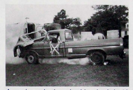
A mock crash of a school bus loaded with students hit by a pick-up truck during Harford County's disaster drill.

In a September 24th disaster drill at the Magnolia Middle School in Harford County, rescue workers treated and transported 30 children and 2 adults from the scene of a mock vehicular crash. A school bus loaded with students hit a pick-up truck carrying a hazardous