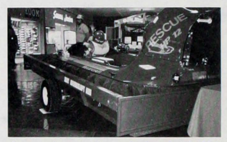
A rescue hovercraft was displayed at the Valley Mall in Hagerstown.