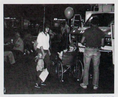
EMS Week activities at the Country Club Mall included blood pressure screenings and an ambulance display by Southern Garrett County Rescue Squad.

The Regional EMS Council, Cumberland Memorial Hospital, and numerous ambulance companies presented displays and programs at the Country Club Mall throughout EMS Week. The council's display focused on EMT recruitment, and a trauma center set-up was sponsored by the hospital. A Med-Evac helicopter from Section 5 was also on site for viewing by the public. Programs were held each evening and involved ambulances from LaVale Volunteer Rescue Squad, Frostburg Area Ambulance Service, Southern Garrett County Rescue Squad, Tri-Towns Ambulance Service, and Cresaptown Fire Department. A demonstration emphasiz-