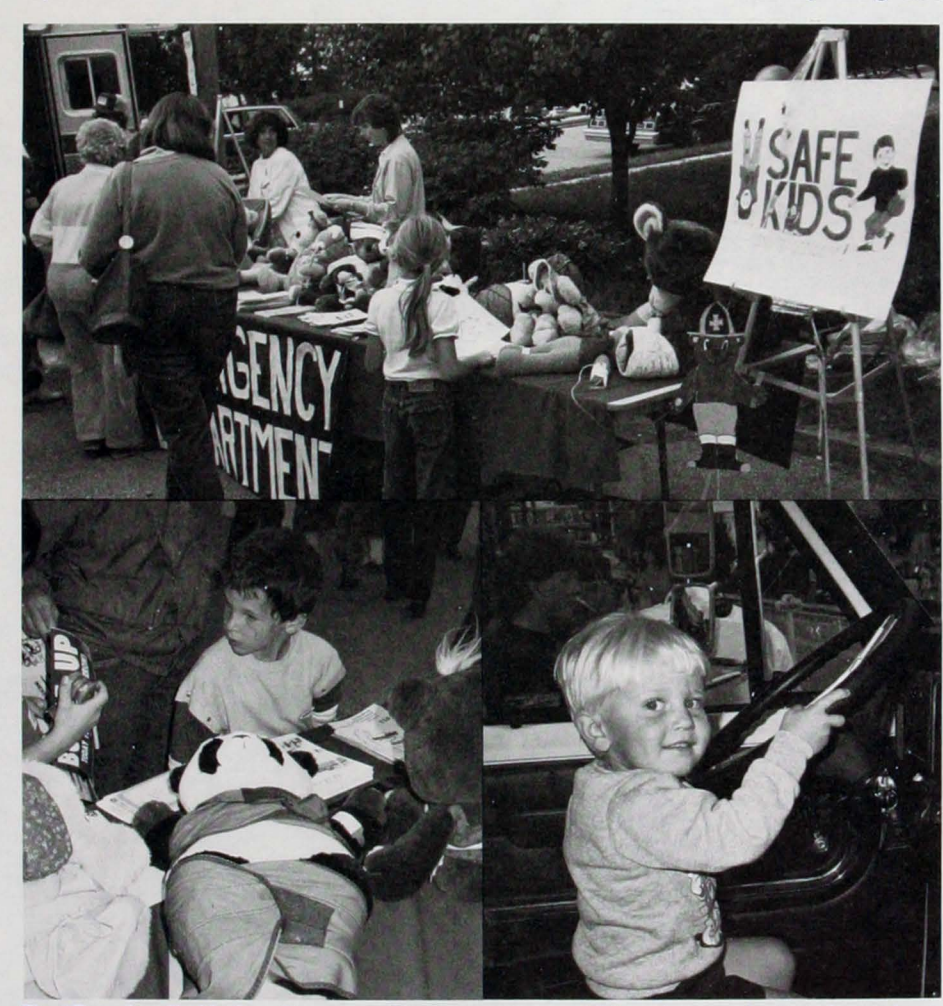
The "Traveling Teddy Bear Emergency Department" gave children the opportunity to learn about emergency medical procedures and ambulances.