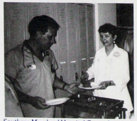
Southern Maryland Hospital Center honored its ED employees at a "recognition luncheon."