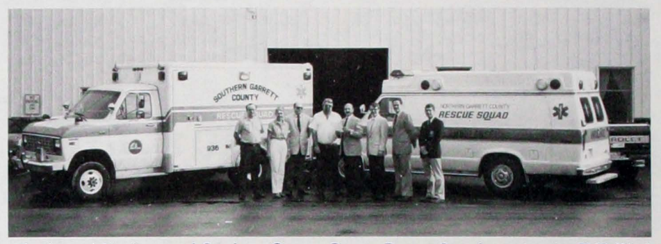
Members of Northern and Southern Garrett County Rescue Squads receive the EMS Week proclamation from Garrett County commissioners.