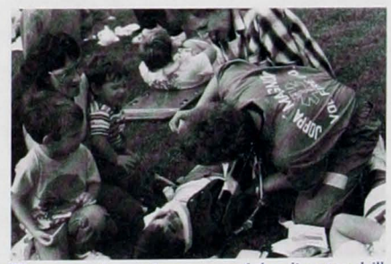
The secondary triage area of the disaster drill at the Magnolia Middle School in Harford County.

chemical in this scenario. Members of the Joppa/Magnolia, Abingdon, Kingsville, and Cowenton Volunteer Fire Companies treated and triaged victims at the scene and transported them to Franklin Square Hospital, Harford Memorial Hospital, and Fallston General Hospital. The 2-hour drill also included a mock Med-Evac transport to the MIEMSS Shock Trauma Center.