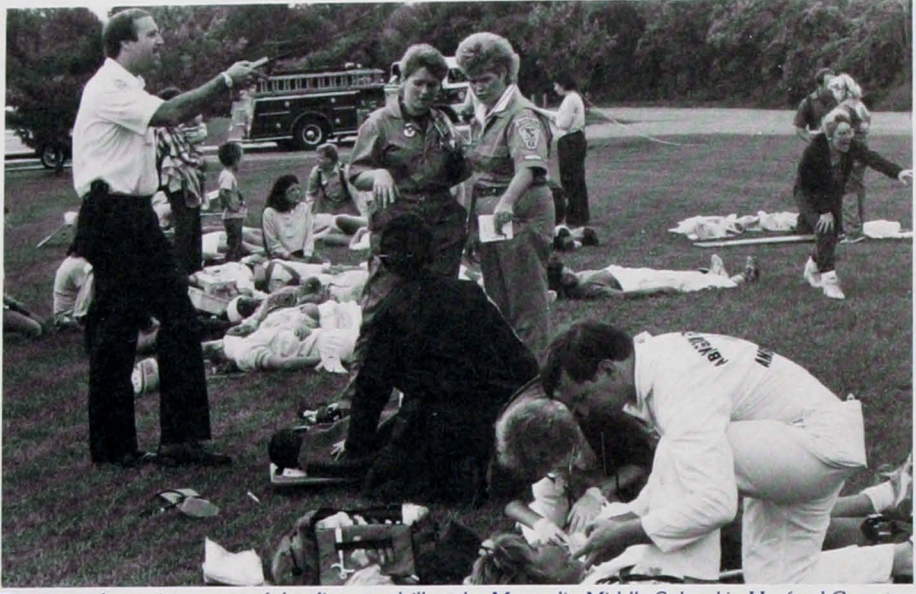
The secondary triage area of the disaster drill at the Magnolia Middle School in Harford County.