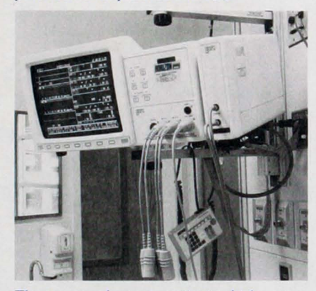
The power columns in patient cubicles are equipped with monitors that display physiologic parameters such as blood pressure, heart rate, and respiratory measurements. The information collected about each patient is transmitted to the bedside computer workstation.

new network is connected to more devices, uses time-saving input methodologies, employs automated flow sheets and flexible reprint mechanisms, and facilitates cross-references to historical statistical information. Training in the use of the network will be provided by the vendors supplying the various programs.