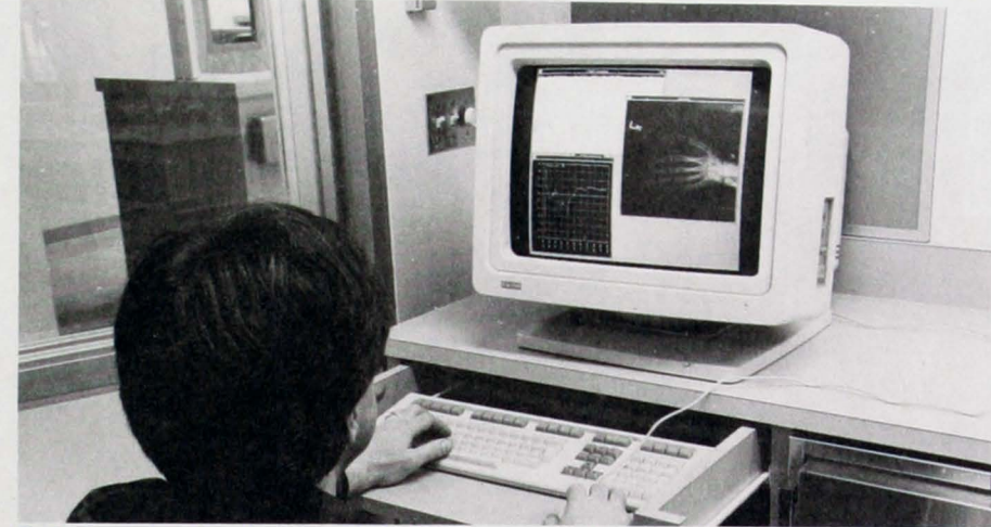
Bedside workstations have a variety of processing, windowing, and graphics capabilities. These powerful units will store patient data, which will be "dumped" to permanent storage in the computer center at planned intervals.

In comparison with MIEMSS' former computer system (a traditional late 1970s system, according to Mr. Guenon), the