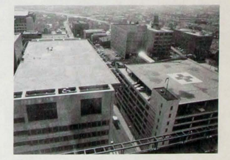
The heliport atop the new building (at left) is larger than the heliport currently used and can accommodate up to four helicopters.