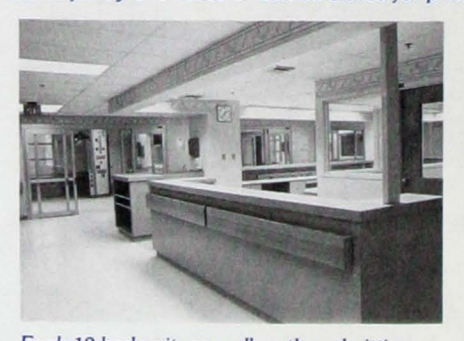
Each 12-bed unit, as well as the admitting, recovery, and outpatient areas, has a patient information center.