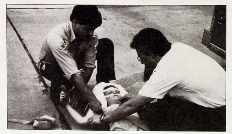
Preparing a child for transport is taught during the PALS program.

PALS programs are scheduled for January 30-31 in Baltimore; April 3-4 in Salisbury; and June 6-7 in Hagerstown; these are offered by the MIEMSS Department of EMS Nursing and Specialty Care. In addition to certification, continuing education credits are available. Preregistration and precourse preparation with the manual are mandatory. The manual will be sent upon receipt of registration. For further information, call 0301-328-3930.