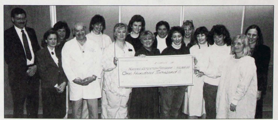
Physicians Support Nursing Staff ...

The physicians from the Shock Trauma Center recently presented a check for $100,000 to the nursing retention program.