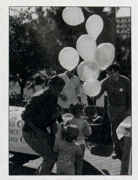
Children collect EMS balloons and coloring books during EMS Week activities.

EMS Week activities planned for Washington County include placement of a full-page ad saluting EMS personnel in the Herald Mail, sponsored by Washington County Hospital (WCH), the region's areawide trauma center; a picnic sponsored by WCH to be held on September 16 at the Williamsport American Legion; and arranging media coverage about the 911 system. Frederick Memorial Hospital plans to sponsor a picnic for EMS volunteers. During the week-long Frederick County Fair, which will run concurrently with EMS Week, physicians and nurses from Frederick Memorial Hospital, together with prehospital care providers, will provide EMS coverage to fairgoers.