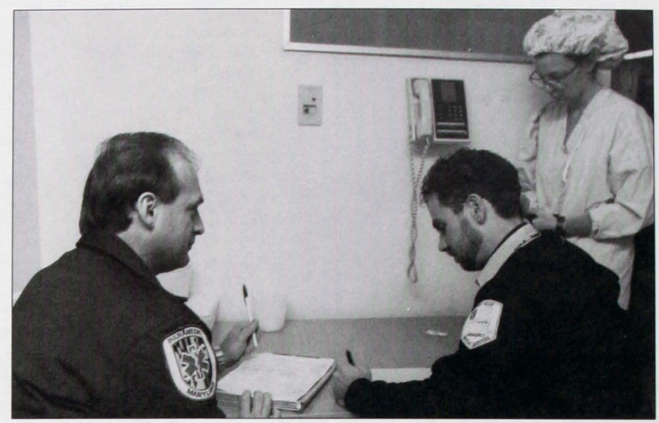
Prehospital care providers complete runsheet after transporting a patient to the Shock Trauma Center.

The changes in questions and runsheet format are described in detail in the MAIS User's Manual. A copy of the manual should be available in every fire house/EMS station. Supplementary to the User's Manual is a 16-minute videotape that was produced by MIEMSS Information and Media Services and distributed to the regional administrators in mid-June. Any prehospital care provider who has questions about the new runsheets is encouraged to review the manual and videotape for assistance. Matters that are