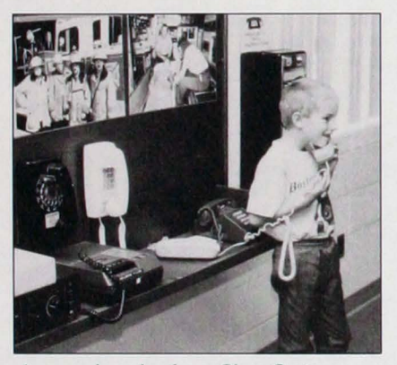
A second-grader from Clear Spring Elementary School practices making a 9-1-1 call.

and reassembled on the village grounds by firefighters and community members. Most of it is exactly as it was after the fire-soot-covered furniture, a TV with its backing melted and deformed, charred pots and kitchenware, heat-twisted plastic coke bottles, blackened canned goods, and the stench of smoke that clings through the years and makes many of the children hold their noses.