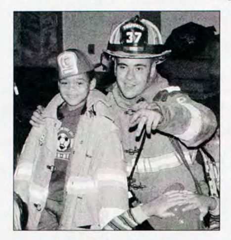
Wheatley Special Center students try on fire helmets and other firefighter clothing as they learn about fire safety from volunteer and career members of Prince George's County Fire/EMS Department.