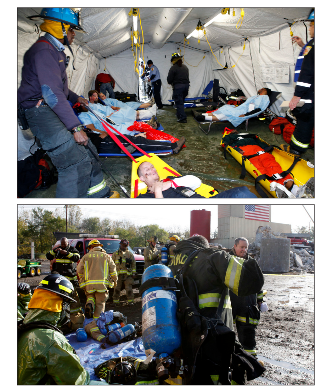
In the scenario of Vigilant Guard 2010, an explosion collapsed part of a chemical production facility, resulting in mass injuries. During the drill, EMS providers practiced using the Maryland triage tags and the new electronic patient tracking system.

National Guard personnel from Maryland and surrounding states participated, in coordination with the City of Baltimore and the Baltimore Urban Area Security Initiative and more than 30 federal, state, and local government agencies. MIEMSS assisted with the triage process, using triage tags and the new electronic patient tracking system.