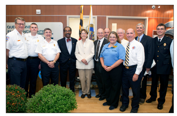
Members of the EMS Board of MIEMSS and of the Maryland EMS community at the dedication of Queen Anne's Emergency Center.