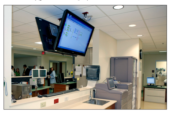
Following the dedication of the Queen Anne's Emergency Center, those attending could tour the facility, including a nursing station shown here.