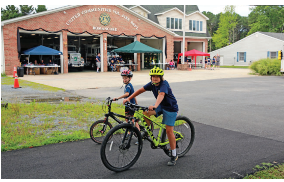
▲ Participants of the Bike Helmet Drive-Thru are ready to ride the Kent Island Trail, which runs right in front of UCVFD.

UCVFD has been a Safe Kids Maryland community partner for many years and worked with the EMSC Program to support injury prevention education through the Maryland State Firemen's Association Risk Watch programs. Through a Maryland Highway Safety Office Bike Safety grant, UCVFD has received bike helmets, a demonstration manikin, and educational materials. UCVFD also created an activity book for children using Safe Kids