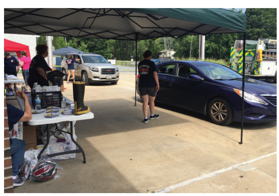
▲ In the picture above, vehicles move through Station 2, where they received education on proper bike helmet fit, and Station 3, where they receiving the helmet that matched the size and color selected at Station 1.