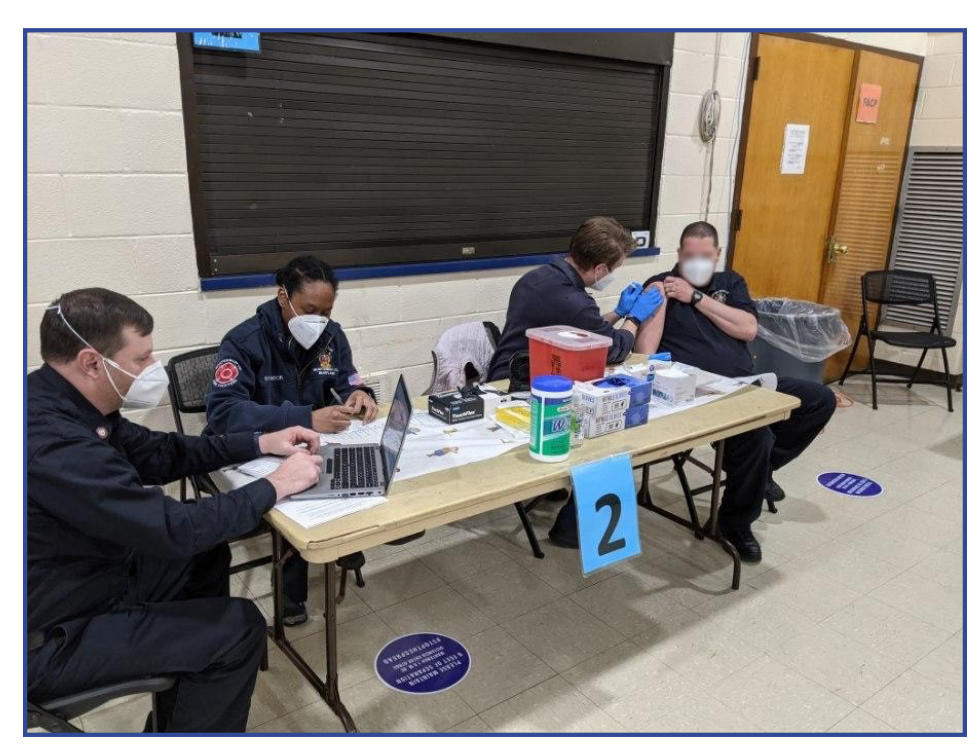
▲ Montgomery County Fire and Rescue Service (MCFRS) career and volunteer paramedics working with the Montgomery County Department of Health and Human Services staffing a COVID-19 vaccination POD at the White Oak Community Center.

After completion of didactic and practical training, the EMT needs to submit an application on the MIEMSS licensure website (www.miemsslicense.com). This application will be approved by the EMSOP with verification that shows successful completion of training and competency in the safe administration of an intramuscular injection.