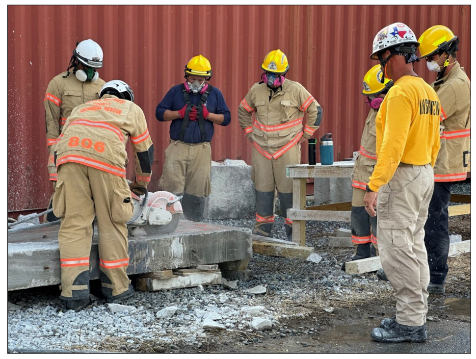
MDERS sponsored MCFRS and PGFD personnel.

■ Breaching: Students learned techniques to break through and access obstructed areas. Participants drilled holes in a triangle formation, then chiseled away the surrounding areas, allowing the triangle to be lifted out, revealing an opening for entrance or extraction.