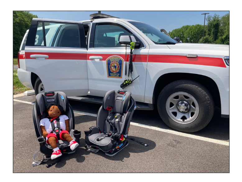
Scenes from four trainings between July and September 2022. [Clockwise, from top left: Washington County, Allegany County, Ocean City Fire Department, and Calvert County.]

~ Additional Maryland EMSOPs invited to participate in 2022-2023 Pilot EMSC CPS Project ~