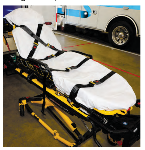
* Some older Stryker stretchers may use a different shoulder restraint. Refer to the appropriate Stryker manual and videos for complete instructions and information on product storage and maintenance.