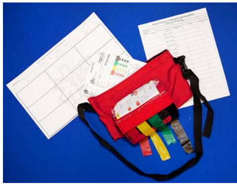
Enhancements to the Maryland Triage Kit requirements