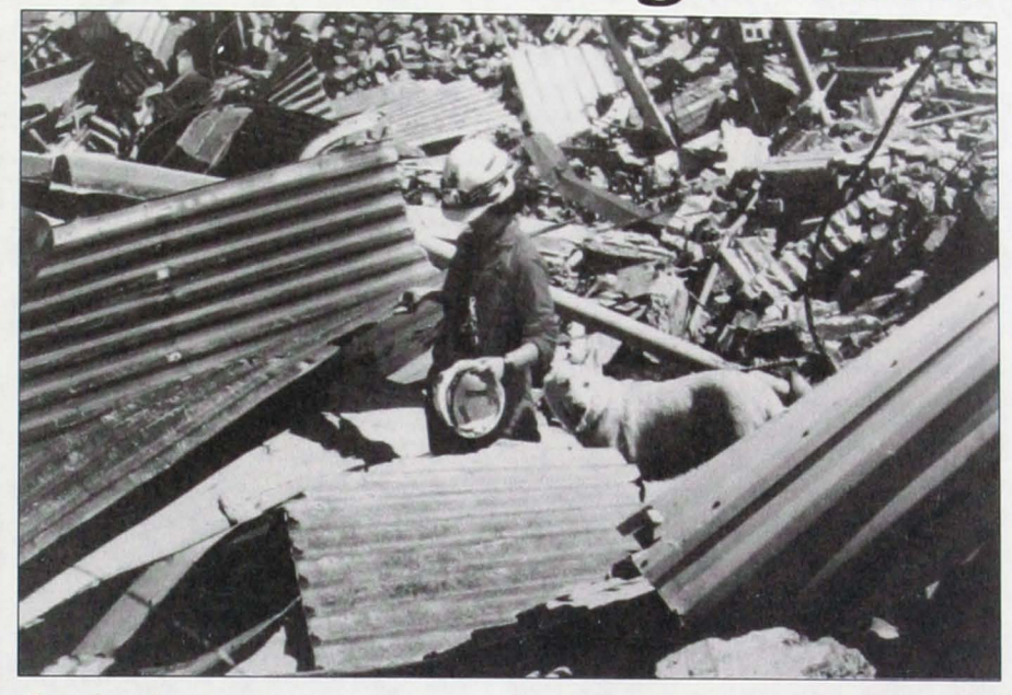
Search and rescue dogs are used during disasters.

Air-scenting dog SAR units respond under the direction of law-