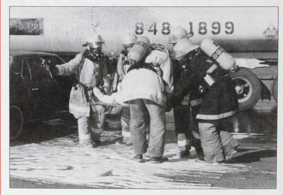
A foam blanket is used to help prevent fire during a haz mat drill.

To contact the Baltimore County SAR unit for either information or an emergency response, call the 24-hour Baltimore County dispatch at 301-887-4592.