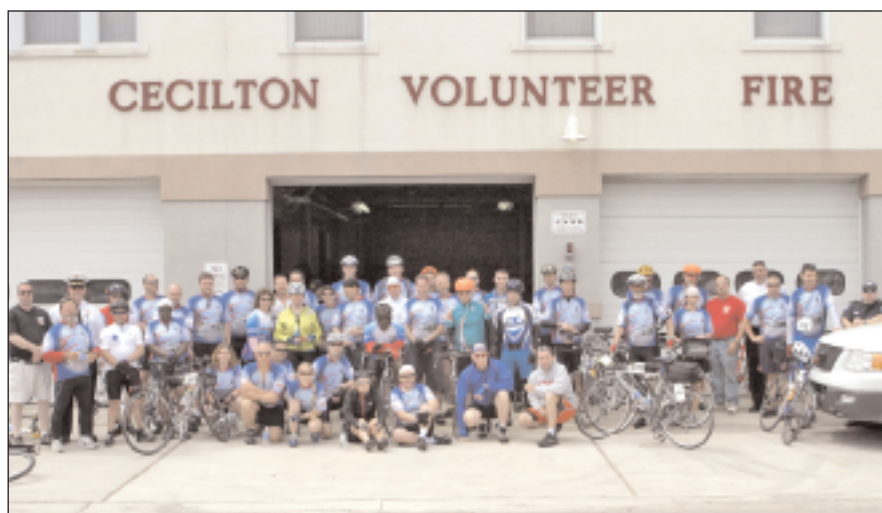
Participants in the National EMS Memorial Bike Ride stop to rest at the Cecilton Volunteer Fire Company.