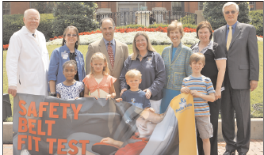
A press conference to educate the public in the Baltimore area about Maryland's new Child Passenger Safety Law was held June 30 at the Johns Hopkins Hospital.