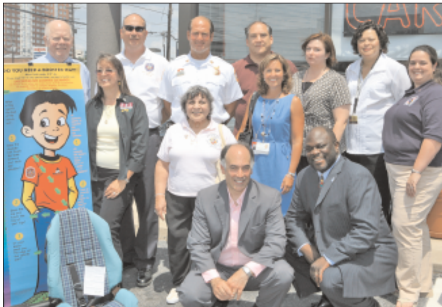
Many gathered at the Fitzgerald Auto Mall in Montgomery County on June 25 to participate in a press conference to heighten the public's awareness about Maryland's new Child Passenger Safety Law effective June 30.

In 2002, Delegate Bronrott and Senator Forehand sponsored legislation that made Maryland the first state in the Mid-Atlantic region with a child booster seat law, but an amendment limited it to a half-strength requirement that has protected child passengers only until they turn age 6. With the new 2008