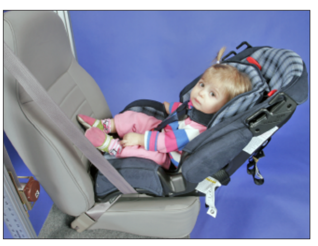
Rear-facing convertible car seat: allow toddlers to rear face up to 35 pounds (weight limits differ by brand).

In fact, the American Academy of Pediatrics (AAP) recommends that infants should ride rear-facing to the maximum weight or height of the rear-facing convertible (or toddler) seat because it provides the best protection. Rear-facing provides better protection than forward-facing because infants and young children have weak neck and shoulder muscles and soft, immature bones. Car seats, especially in the rear-facing position, safeguard these fragile parts and provide maximum protection during a collision. When positioned rear-facing, the back of the car seat absorbs much of the energy of the crash, cradling the child's head and neck. This helps prevent brain and spinal cord injuries. Most convertible car seat manufacturers recognize the value of rear-facing, so car