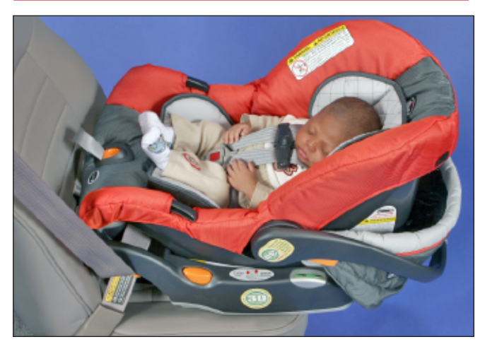
Rear-facing infant seat: for newborns and young babies (weight limits, from 22-30 pounds, differ by brand).