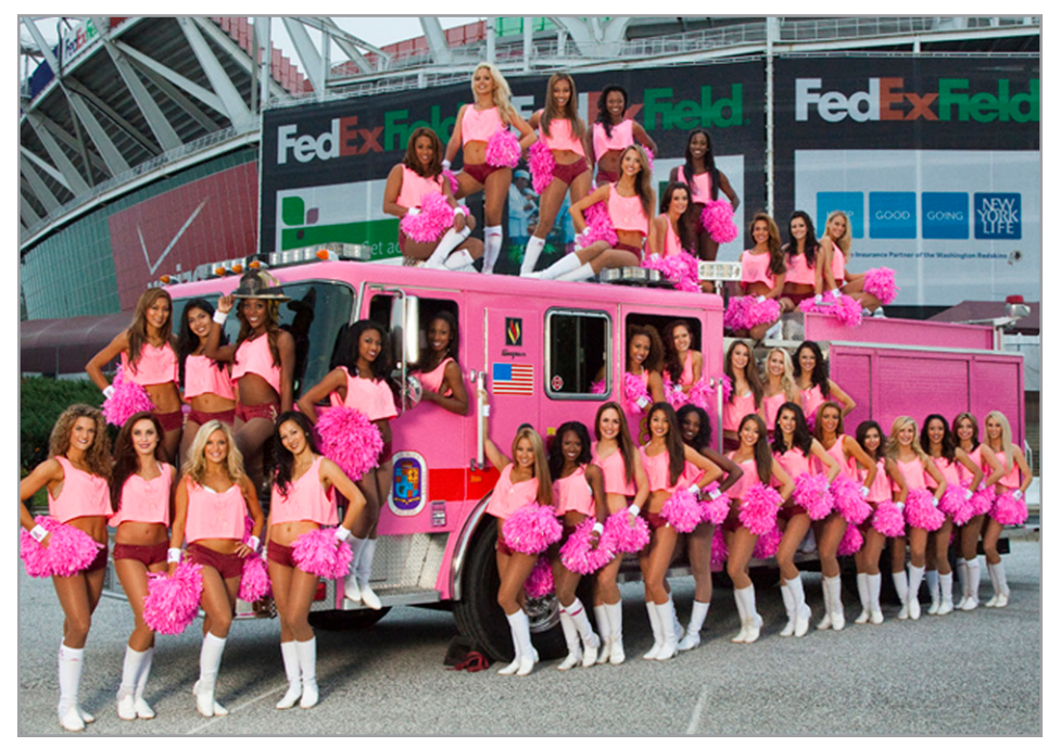
The "Pink Pumper" made an appearance at FedEx field prior to a home game on October 7, 2012.

available at department stations throughout Prince George's County and online at <u>www.rightcoastapparel.com</u> (keyword "PGFD").