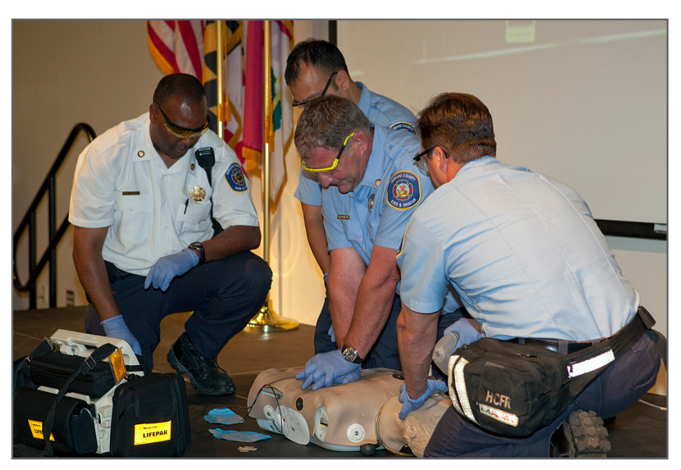
Members of HCDFRS demonstrate high-performance CPR at the Cardiac Arrest Resuscitation Experience Symposium in Howard County on May 6, 2012. Each Provider is assigned a specific role during the resuscitation, and the method is timed precisely.