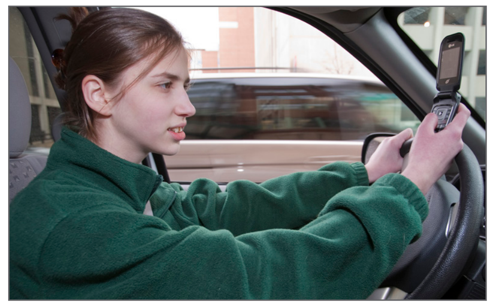
Texting uses all three physiological functions that are critical for driving: visual, manual, and cognitive. This is what makes it so dangerous to do while driving. Reading, writing, or sending electronic messages while in a travel portion of the roadway are prohibited by Maryland law.

By far, the most risky behavior is texting while driving. The Virginia Tech Transportation Institute published a research study in 2009 in which it found that texting while operating a vehicle is 23 times more dangerous than abstaining from distracting behaviors (the research focused on commercial motor vehicle operations).