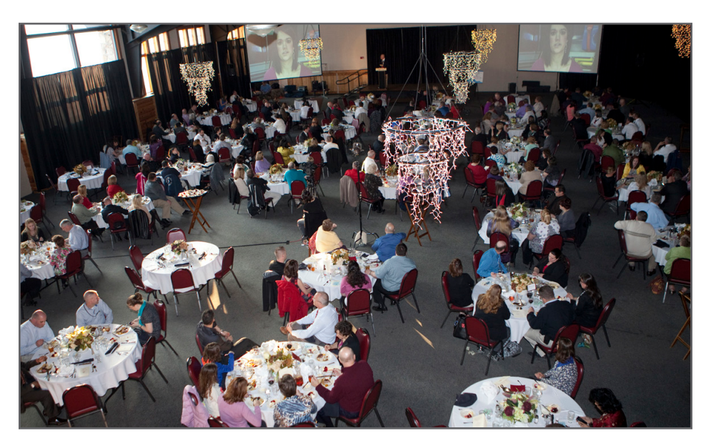
Guests at the first annual Night for Stars Stellar Service Awards enjoy a video presenting first-hand accounts of the award-winning EMS calls.