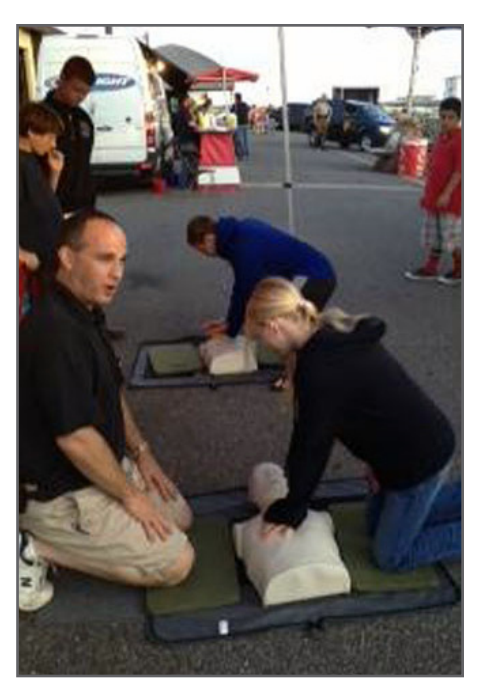
The Baltimore County Fire Department provided hands-only CPR training to over 2,000 people at the 2013 Maryland State Fair. County Career and Volunteer Fire Department members staffed the hands-only CPR tent throughout the 11-day event. The public was very enthusiastic about having the opportunity to learn how to save a life, and trainers thoroughly enjoyed the opportunity to interact with citizens.