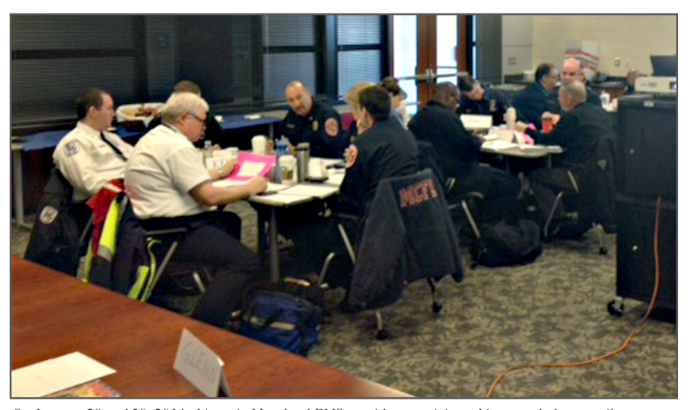
On January 28 and 29, 2014, thirty-six Maryland EMS providers participated in an ambulance strike team leader course instructed by Texas A&M Engineering Extension Service (TEEX). Funding for the course was provided by Montgomery Fire and Rescue's Emergency Response System project. This course and future offerings are being held as part of MIEMSS' effort to develop pre-designated ambulance strike teams that can respond quickly to emergencies in Maryland as well as other states.

Registration information available soon on www.miemss.org