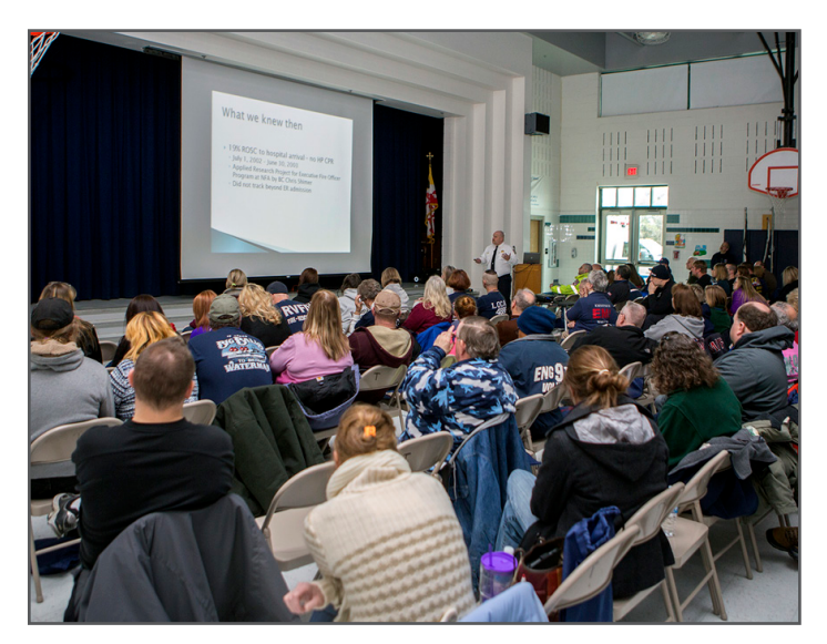
Attendees of Winterfest 2014 pack the gym to hear an update on high-performance CPR (HPCPR) and implementing a Code Resource Management approach to HPCPR.