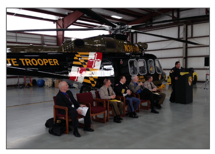
MIEMSS joined Maryland State Police and other public safety partners on March 5, 2014, as the new AgustaWestland 139 helicopter was dedicated in Salisbury, home to Trooper 4.