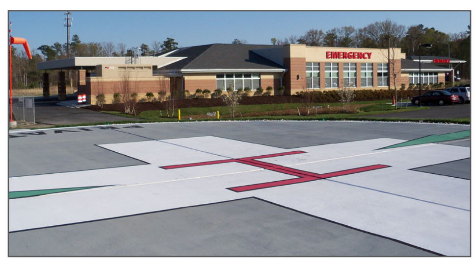
Queen Anne's Emergency Center and helipad.

Effective March 1, 2014, the Queen Anne's Emergency Center, located at 115 Shoreway Drive, Queenstown, Maryland has been approved as a MIEMSS Designated Base Station and can provide base station medical consultation.