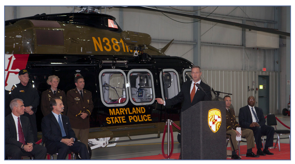
Maryland Governor Martin O'Malley introduces the AgustaWestland 139 at Maryland State Police headquarters at Martin State Airport in Baltimore.

This new fleet of ten (10) AW-139s provides the MSP Aviation Command with expanded capabilities to proactively meet the needs of MSP missions throughout the state. The AW-139 is a true stateof-the-art helicopter that successfully performs throughout the world, in places such as Ireland, Canada, Norway, Italy, Australia, the Middle East, and Asia, and is currently flying multi-mission sorties daily with the US Customs Border Patrol, the Los Angeles City Fire Department, and the New Jersey State Police. The AW-139 has established itself as the aircraft of choice among publicly funded programs. It meets all current National Transportation Safety Board and Federal Aviation Administration HEMS recom-