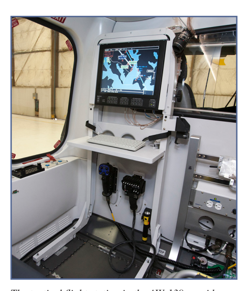
The tactical flight station in the AW-139 provides a searchable database with the ability to identify any location or address and links to the Wescam MX-15i camera, TrakkaBeam 800A search light, and flight management system (autopilot) for aircraft navigation.

During the initial specifications development for the AW-139, MSP Aviation Command planners focused on meeting the current and future needs of Maryland (Continued on next page)