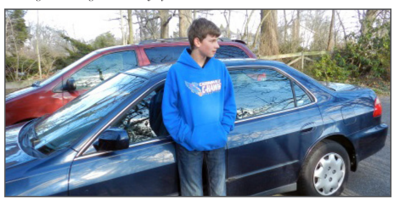
Those youth that are not quite driving but have been riding for a while are more likely to engage in risky behaviors. MIEMSS' Child Passenger Safety and Occupant Protection for Healthcare Project can help you address this age-group with the Be-Tween Riding & Driving: In-Car Safety for Youth Program.

bag safety, real risks on the road, and how to handle difficult in-car situations. The youth program is taught to small groups of 10–15 year olds in a two-hour class. It's perfect for summer camps, scouts, and after-school programs. If you would like to learn more, contact CPS@miemss.org or call 410-706-8647.