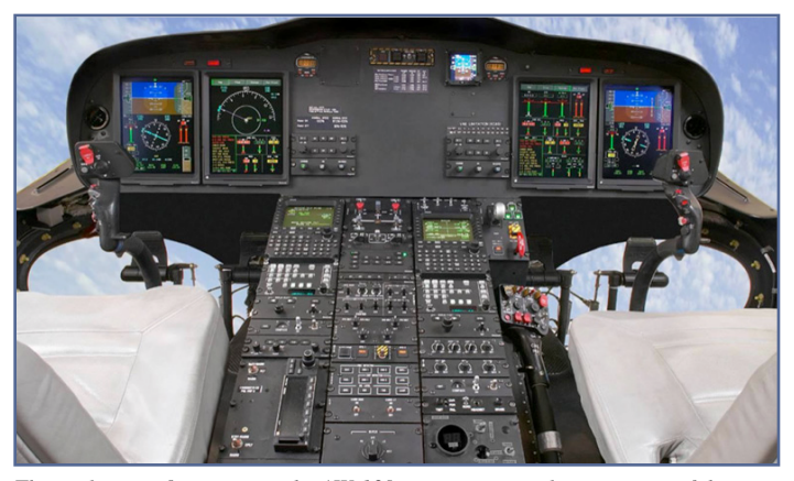
The cockpit configuration in the AW-139 supports two-pilot operation of the aircraft.

The AW-139 provides significant enhancements for all search and rescue missions. A dynamic automated flight control system and a significant increase in available power ensure safer and more efficient flight while performing search or hoist operations. The autopilot has the capability to fly complete search patterns over water and in urban and remote environments. A flight crew member stationed at the dedicated tactical observation station operates the detailed moving map display, external thermal imagery/low light color video camera, and enhanced high output search light. All necessary mission equipment, including the rescue basket, is carried in the large cargo area and immediately accessible while in flight. During a hoist operation, wide cabin doors provide easy loading of a patient secured in a Stokes litter. When supporting response for large structural or woodland firefighting, the AW-139 provides an effective airborne command/control/communications platform for incident commanders on the ground. With on-board digital data recording and microwave video broadcast capabilities, live images can be fed directly to ground-based receivers allowing rapid decision making by incident commanders. The aircraft can easily transport a team of fully equipped firefighters for deployment into confined or panicle