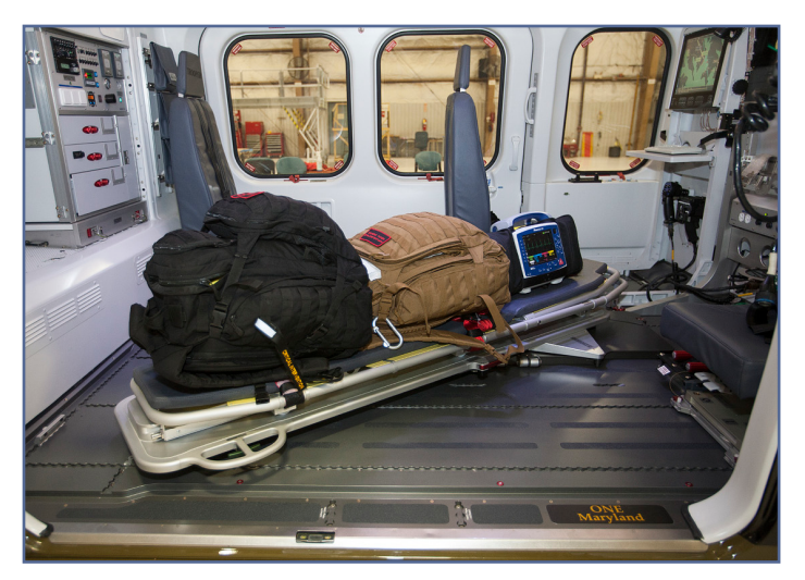
In the AW-139, all patient loading takes place from the RIGHT SIDE of the aircraft. The primary patient is loaded HEAD FIRST.