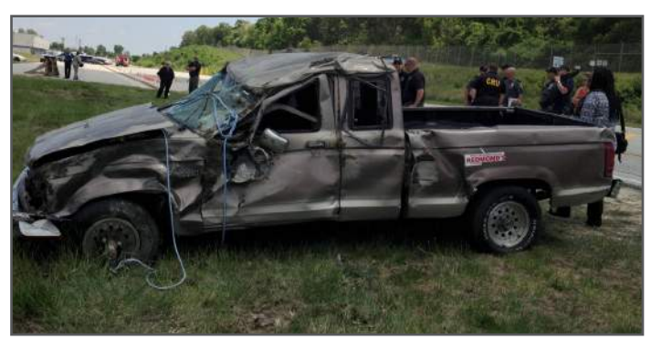
At the Click it or Ticket press event in May, law enforcement and the Motor Vehicle Administration partnered to demonstrate the effects of a rollover crash involving a pickup truck (left). Spectators survey the damage after the crash (right).