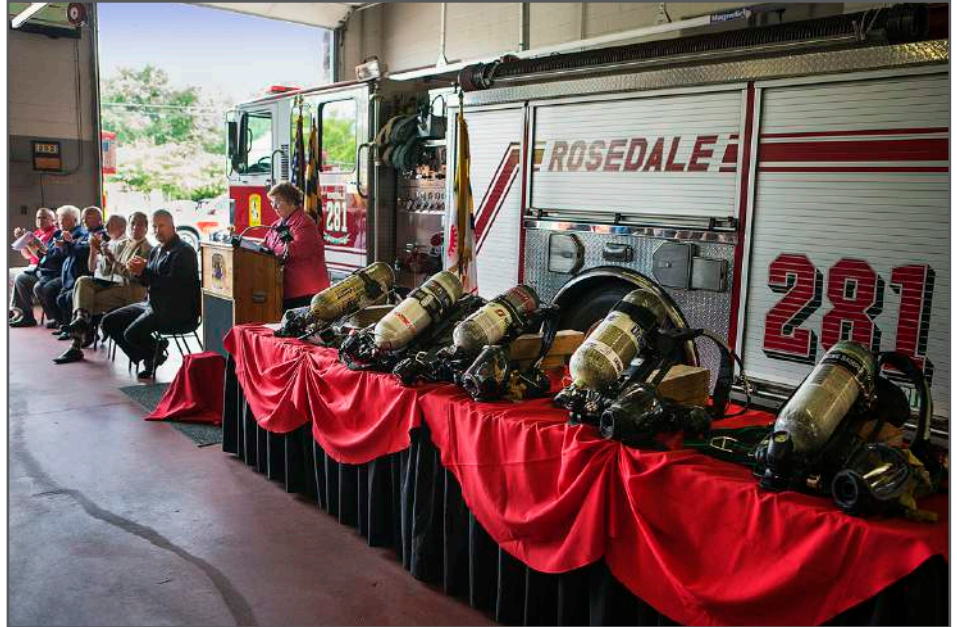
Senator Barbara A. Mikulski addresses attendees at a press conference at Rosedale Volunteer Fire Company to announce two federal grants totaling $4.6 million for emergency responder needs throughout Maryland.

The first grant, through the US Department of Homeland Security's Assistance to Firefighters Grant Program (AFG), was for $2,343,600 and given to the Baltimore County Fire Department for the purchase of 372 sets of Self-Contained Breathing Apparatus (SCBA). This will replace equipment currently in use that does not meet NFPA standards. Senator Mikulski also announced that the Maryland State Firemen's Association (MSFA), in partnership with the Maryland Fire Chiefs Association (MFCA), will receive $2,250,000 in federal funding through the US Department of Homeland Security's Staffing for Adequate Fire and Emergency Response (SAFER) program to enhance volunteer firefighter recruitment and retention efforts across Maryland. The goal of the SAFER grant program is to enhance the ability of grantees to attain and maintain 24-hour staffing. The objective of the program is to award grants directly to volunteer, combination, and career fire departments to help the departments increase the number of frontline firefighters and to rehire firefighters who were laid off due to the economy. Since 2001 Maryland fire departments and EMS units have received