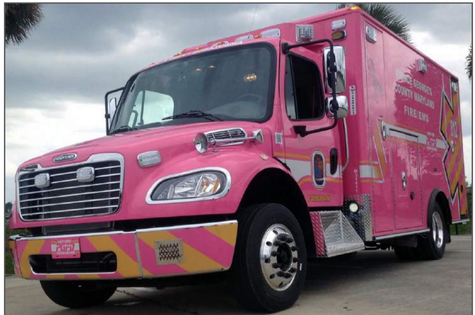
This new pink Paramedic Unit has joined the force at Prince George's County Fire and Emergency Medical Services Department. Suggestions from the public for its new nickname are being accepted by the Department through the end of July.