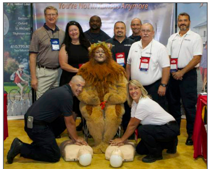
In August 2014 volunteers from Talbot County instructed participants in Hands-Only CPR at the Maryland Association of Counties (MACo) Summer Conference. The "Cowardly Lion" (right photo) was on hand to help show participants that CPR is nothing to be afraid of.