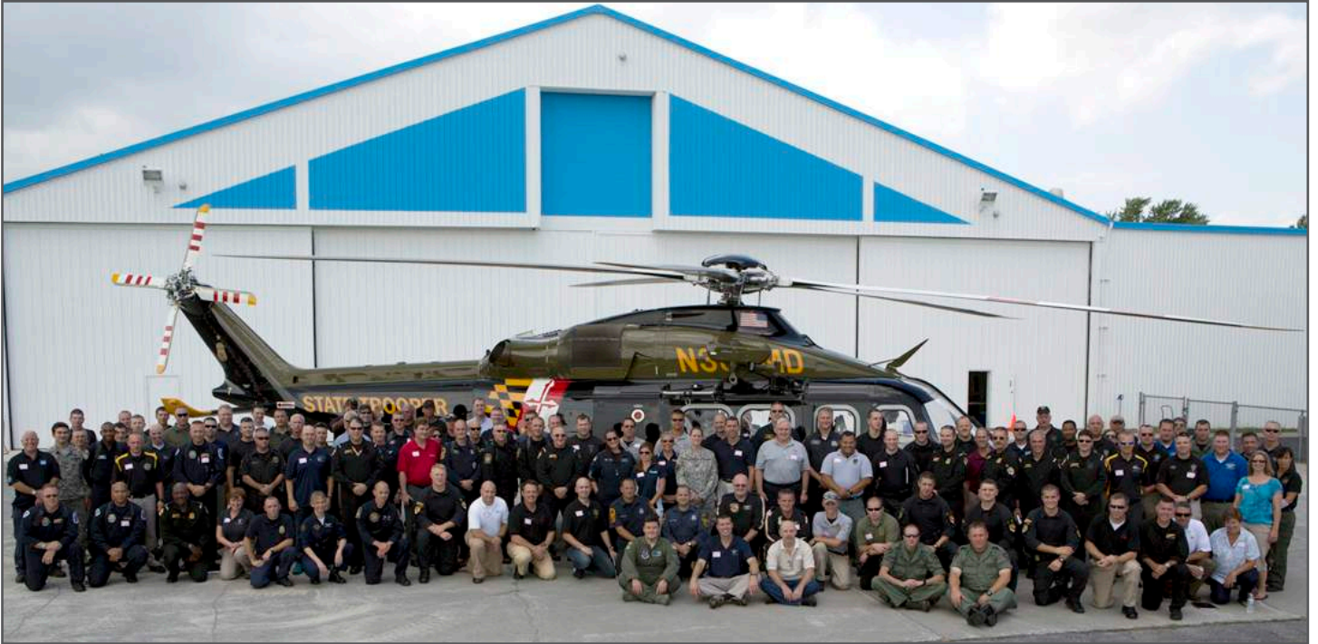
The fall 2014 East Coast Helicopter Operations (ECHO) conference was recently held at the Airplane Owners and Pilots Association's National Aviation (AOPA) Community Center facility at the Frederick Municipal Airport. Helicopters and nearly 200 crew members from Maryland and surrounding state agencies participated in daylong training that focused on medevac, flight operations, and law enforcement missions. The event was sponsored by ECHO, AOPA, and Maryland State Police Aviation Command.