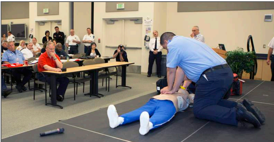
High Performance CPR is demonstrated to the participants during Maryland Resuscitation Academy training in 2013.