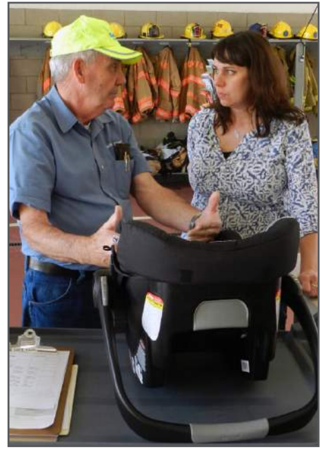
At a Car Seat Check event, a Certified Child Passenger Safety Technician demonstrates the safety features of a car seat to an expectant mother.

safety seat check-up event at the end The registration fee is $85, but scholarships are available for qualifying healthcare/EMS personnel. To learn details about upcoming courses or to register, go to <u>cert.safekids.org</u>. To learn about scholarships for healthcare/ EMS personnel, contact <u>CPS@miemss.org</u> or call 410-706-8647.