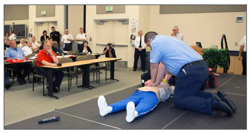
High Performance CPR is demonstrated to the participants during Maryland Resuscitation Academy training in 2013.