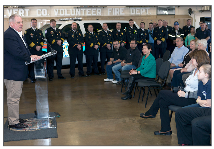
Governor Larry Hogan addresses attendees at the announcement of grantfunded enhancements in technology for fire/EMS in Calvert County.