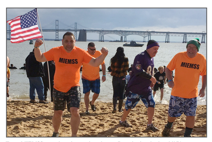
Team MIEMSS complete their polar plunge. Boy, do they look cold!