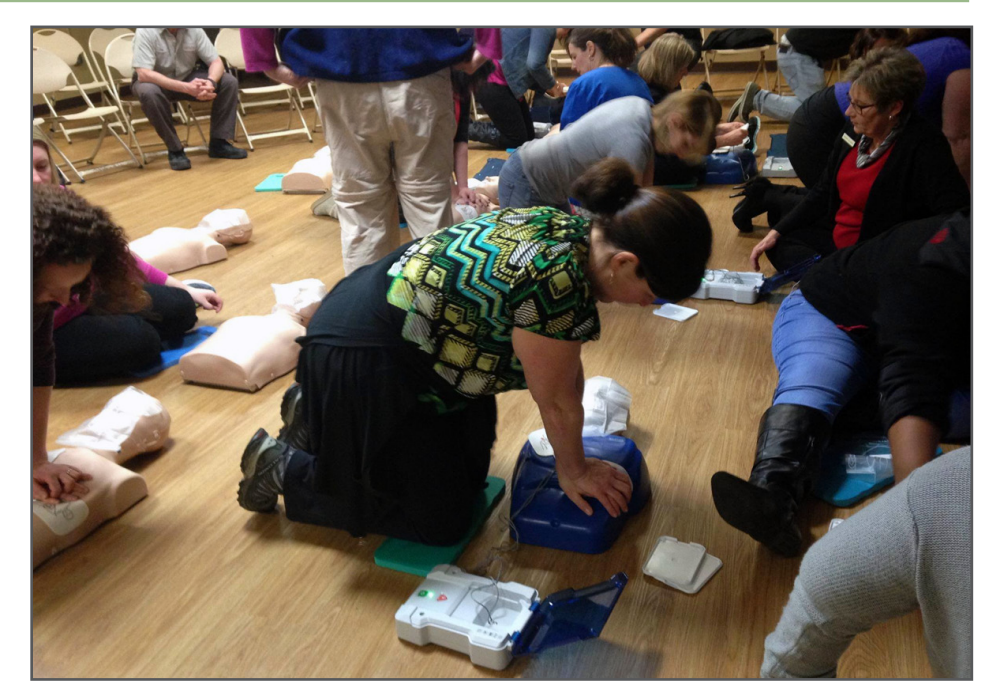
A CPR trainee practices applying an AED and chest compressions on a manikin during the CPR Marathon.

There are approximately 180 AEDs in Talbot County that are registered through the Maryland Public Access AED Program (<a href="http://www.miemss.org/home/hospitals/aed-program">http://www.miemss.org/home/hospitals/aed-program</a>), according to Capt. Wylie Gray of the Talbot County DES.