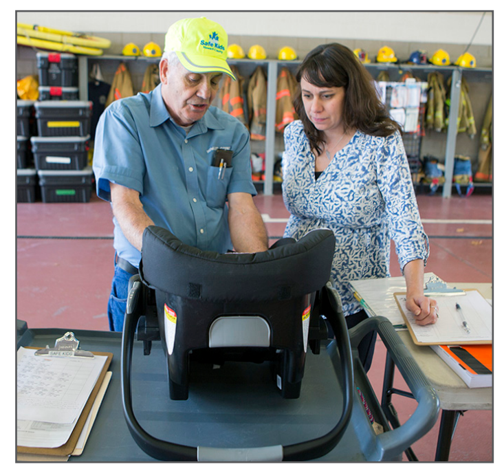
A Certified Child Passenger Safety Technician demonstrates the safety features of an infant car seat to an expectant mother at a check-up event.

To learn details about upcoming courses or to register yourself, go to <u>cert.safekids.org</u>. To learn about scholarships for healthcare/EMS personnel, contact <u>CPS@miemss.org</u> or call 410-706-8647.