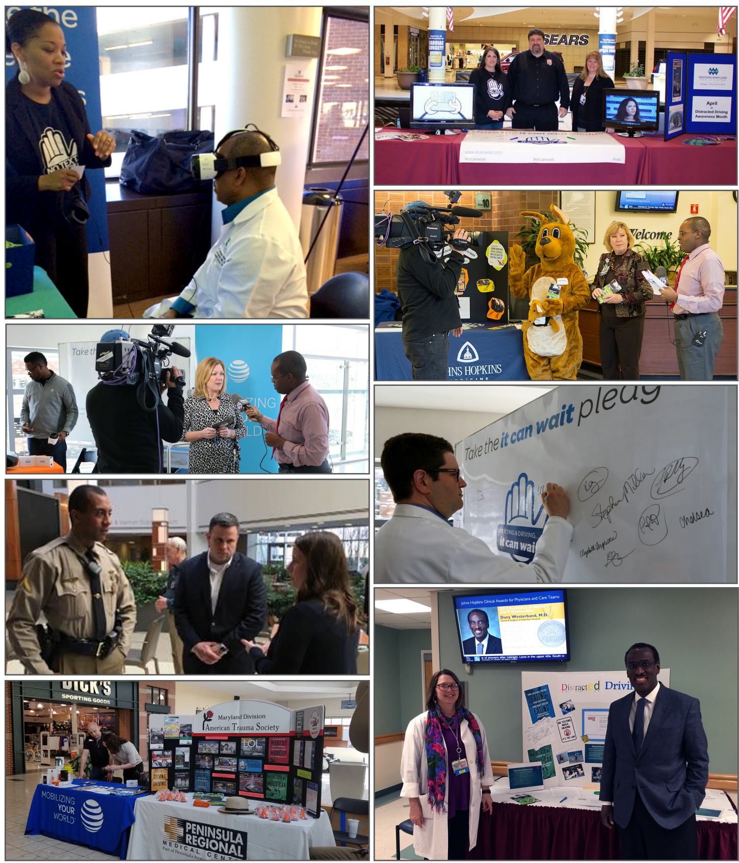
Distracted Driving events took place statewide on April 6, 2016, including virtual reality simulations and pledge drives to not "drive distracted."