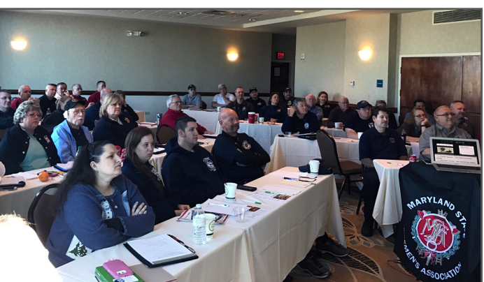
Fire service leaders gathered on December 10 and 11, 2016, to discuss challenges and learn how to implement leadership guidelines at this year's FROG seminar in Ocean City.