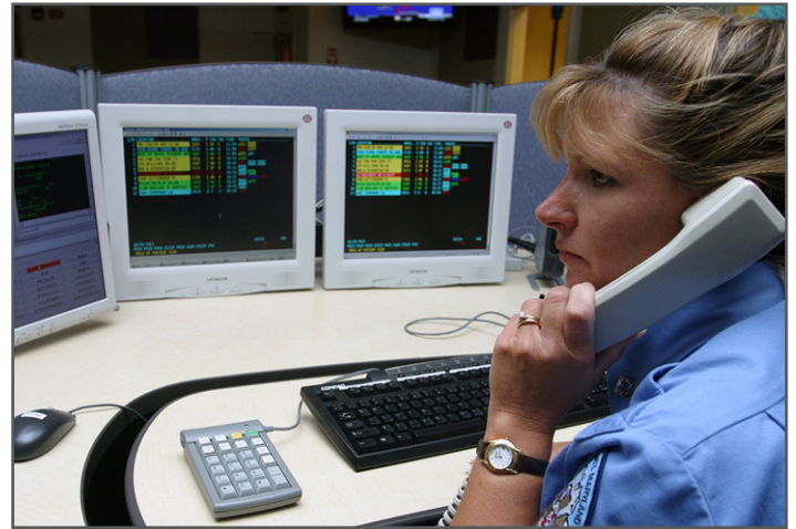
Operators in MIEMSS' new SYSCOM center (left) and at a dispatch center in Anne Arundel County execute their duties as a critical link in the Chain of Survival. We salute these providers, a valuable asset to Maryland's EMS system!