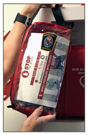
Bleeding Control Kits, like the one pictured, are being placed adjacent to public access AEDs in Charles County, Maryland.

To better serve the citizens and visitors of Charles County, the Charles County Department of Emergency Services will be placing Bleeding Control Kits in countyowned locations alongside public access AEDs. This aligns Charles County with other agencies across the country that are participating in the federal Stop the Bleed campaign. The purpose of the campaign is to prepare and empower the public to save lives by stopping lifethreatening bleeding following emergencies and disasters. Advances made by military medicine and research in hemorrhage control have informed the work of this initiative, to the benefit of the public. For more information about the campaign, visit www.bleedingcontrol.org. The Stop the Bleed slogan and logo are owned by the US Department of the Defense; any use of these marketing materials must be approved by that agency.