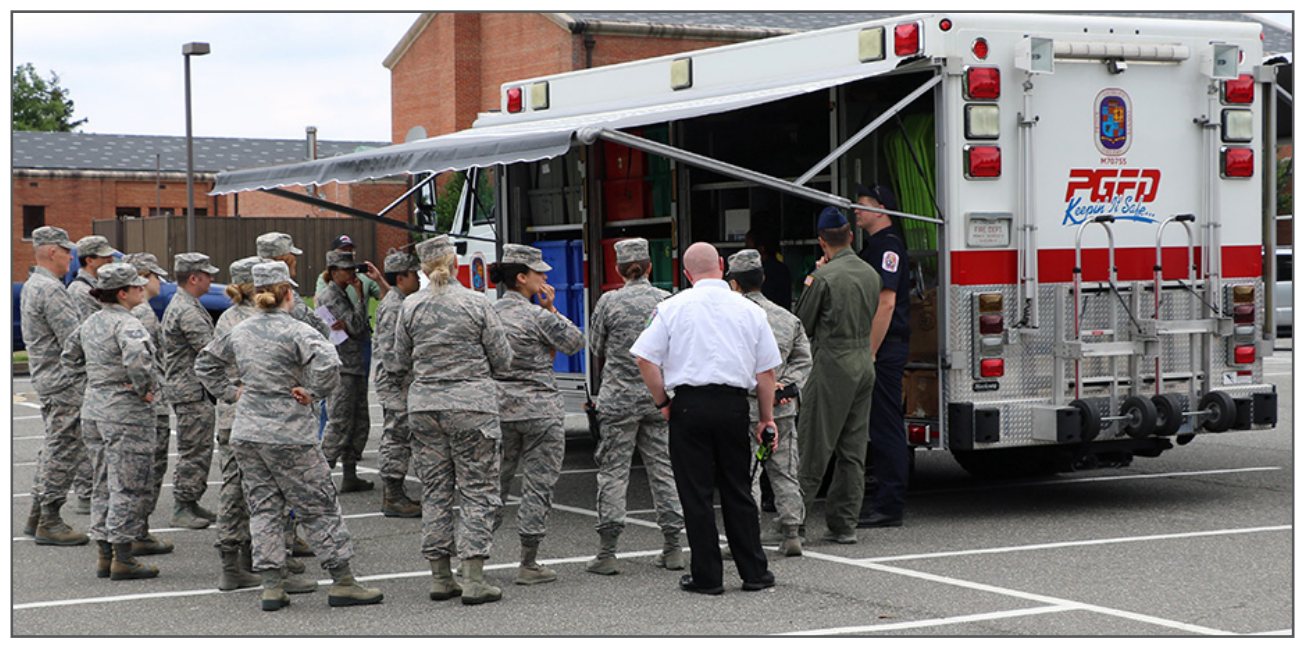
Participants in the June drill at Joint Base Andrews view one of Prince George's County Fire/EMS Department's mass-casualty units.

MIEMSS, Joint Base Andrews, and Prince George's County Fire/EMS Department conducted a mass casualty training event at Joint Base Andrews on June 7, 2017, as part of ongoing training to promote interagency cooperation between federal, state, and local departments when responding to a mass casualty incident. The June drill was held in preparation for the 2017 Joint Base Andrews Air Show, which will be held in September.