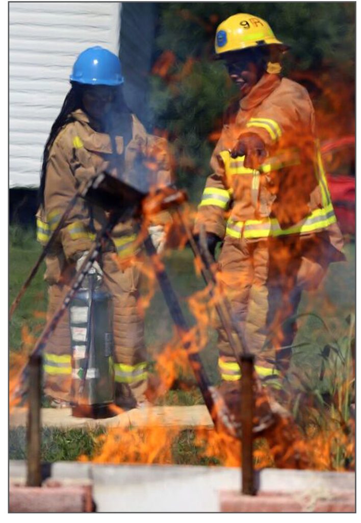
Clockwise from top, campers receive first aid and CPR training, practice using fire extinguishers safely and correctly, and take part in team-building competitions. The 1st Alarm Girls Fire Camp fosters confidence in young women who are considering careers in public safety.