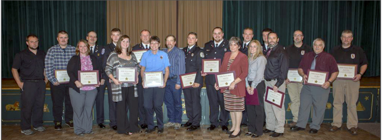
Individuals who received an award for their lifesaving actions are honored at the annual Night for Stars program. Awardees representing the Allegany County incident are pictured top, and those representing the Garrett County incident are pictured bottom.