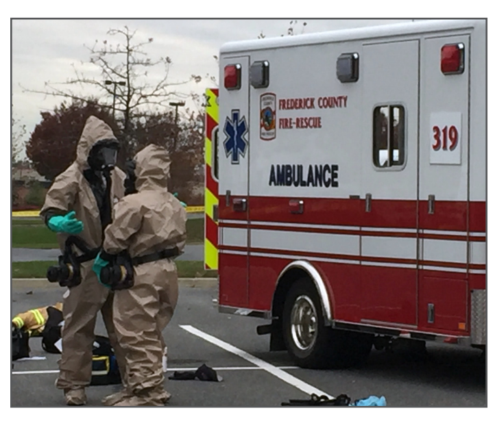
EMS providers participating in the November 14, 2017, HCID drill in Frederick County don appropriate personal protective equipment to deal with a "patient" under investigation for an infectious disease.

To fulfill a second objective of the exercise, EMS providers safely transported the "patient" to Frederick Memorial Hospital. Hospital personnel donned the appropriate personal protective equipment and transfer of care was conducted between EMS providers and receiving hospital staff. Following transfer of patient care, FCFRS EMS providers began the meticulous process of decontamination and doffing of personal protective equipment, with the support of their HAZMAT team.