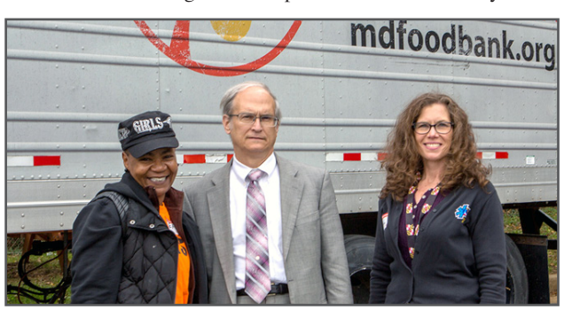
MIEMSS staff volunteered time at the Maryland Food Bank in October 2017 as part of the statewide Day to Serve initiative.