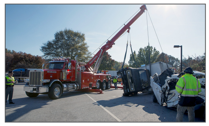
Attendees and news media representatives at the November 15, 2017, traffic safety event were invited to watch a mock crash demonstration depicting what occurs on the scene of a major traffic incident.

To bring attention to these dangers faced by responders, the Maryland Department of Transportation hosted a media event at the northbound I-95 rest area near Laurel on November 15, 2017. Representatives from traffic safety and the emergency response community were in attendance at the event, which provided an opportunity to emphasize the importance of the move over law and distracted driving prevention.