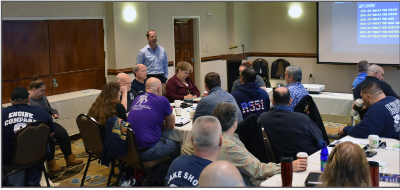
The Releasing the Reins – Art of Succession Planning Seminar was held December 1-3, 2017, in Ocean City. The seminar focused on planning for succession of leadership within the fire service by identifying future leaders, providing them development tools, and setting a plan for them to succeed. Forty-six attendees from around the state participated. The seminar was sponsored and hosted by the Maryland State Firemen's Association Recruitment and Retention Committee.