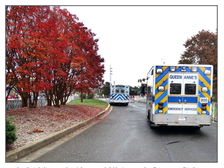
Left photo, members of the mutual aid EMS teams observe runners as they cross the finish line at the 4th annual 10k Across the Bay race. Right photo, Queen Anne's County EMS units wait next to the race course to provide emergency care, if needed.