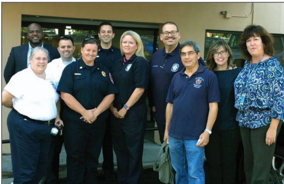
Montgomery County Fire and Rescue Services, Montgomery County Department of Health and Human Services, Shady Grove Adventist Hospital, Suburban Hospital—Johns Hopkins Medicine, Washington Adventist Hospital, and other facilities have partnered to reduce the number of EMS calls and unnecessary ED visits. Shown here are team members with some of their community partners from Health and Human Services and the Mansfield-Kaseman Clinic.