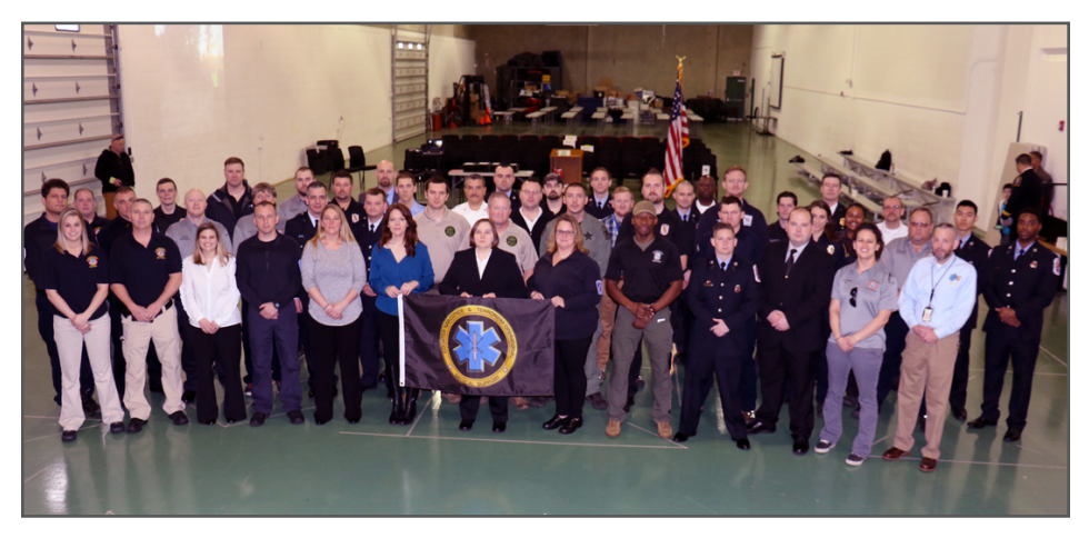
The February tactical EMS course, held in Prince George's County, instructed 47 individuals in providing emergency medical care as part of a law enforcement team.