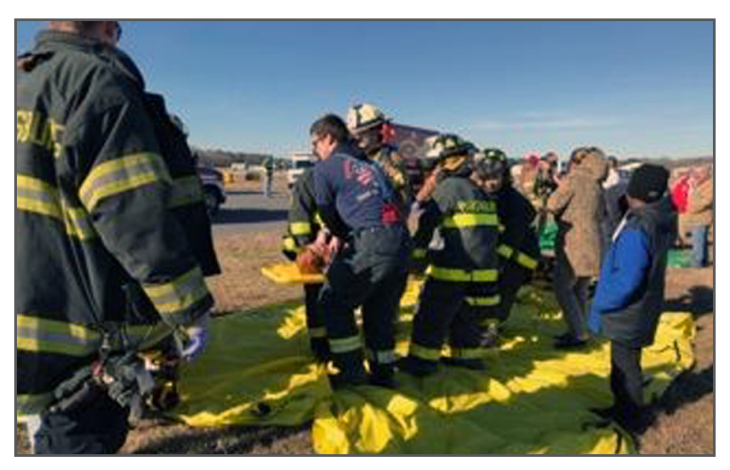
EMS providers from departments within the Salisbury Regional Airport region participate in patient triage, treatment, and transportation at the airport's annual emergency plan exercise.