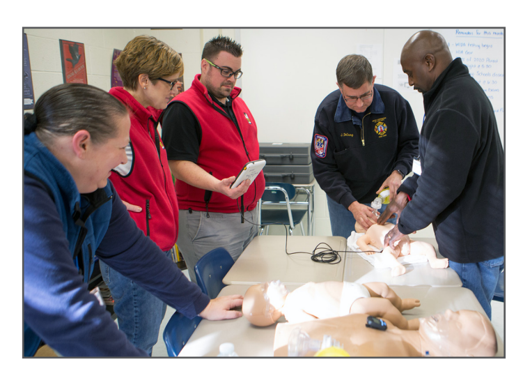
January 25–28, 2018, marked the 21st Annual Winterfest Conference, held this year in Easton, Maryland. The conference, organized by Talbot County Department of Emergency Services (DES) and supported by a number of generous sponsors, was attended by approximately 220 health care providers and included a range of informative speakers. Plenty of hands-on skills practice was offered for pediatric high-performance CPR, dealing with patients with dementia, and "Go, No-Go" situations. Many thanks to all the providers who attended this year's conference, enhancing their knowledge in order to provide the best quality care to the ill and injured.