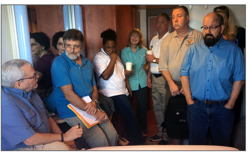
Members of the critical incident stress management team who traveled to the US Virgin Islands in February 2018 meet to discuss CISM strategies.

The USVI team consisted of one mental health leader, two administrative/logistics personnel, seven mental health providers, and seven fire/EMS peers trained in critical