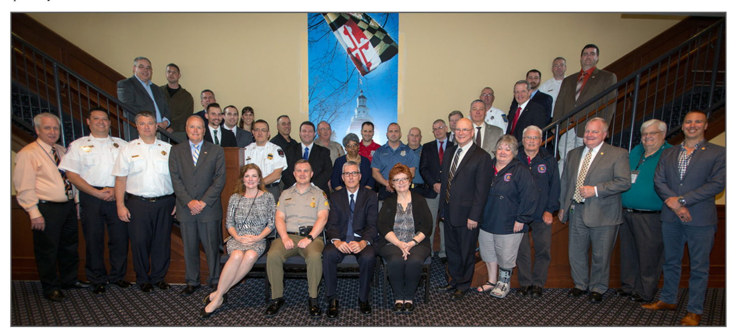
Members of the Maryland Active Assailant Interdisciplinary Work Group. The work group convened on May 17, 2018, to continue collaborative efforts to prevent and respond to active assailant incidents.

The AAIWG reconvened to introduce new members and to identify next steps; these will include working more closely with schools and other community partners, updating the AAIWG guidance (published in 2014), and on working prevention strategies. The group will continue to meet quarterly.