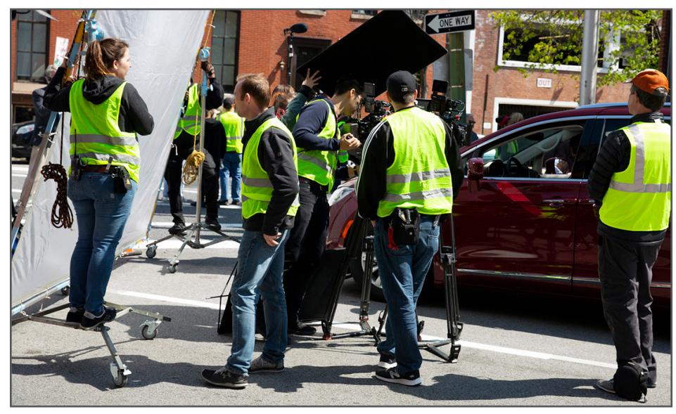
The intersection of Park Avenue and Read Street in Baltimore was the location for the video shoot of the soon to be released Public Service Announcement filmed for the Regional Bicycle and Pedestrian Safety Education Campaign.

Coordinating and supporting intensive region-wide enforcement of pedestrian and bicyclist traffic safety laws – and making drivers, pedestrians, and cyclists aware of enforcement efforts.