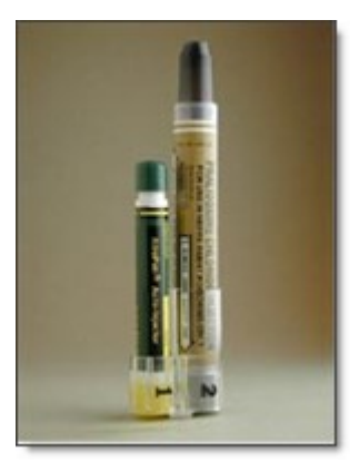
Mark I Kit