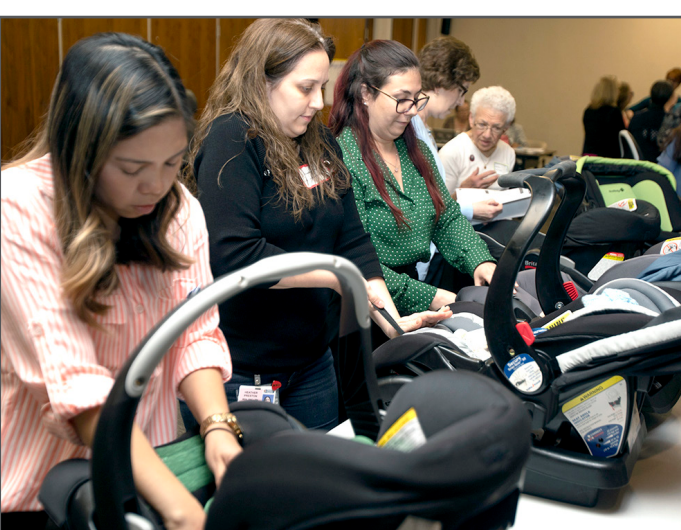
Both educational and hands-on activities were part of the Child Passenger Safety for Maryland Newborn Nursery and NICU Nurses Workshop held at St. Agnes Hospital.

learning how to write a protocol for their units. Additionally each hospital left with more accurate information to share in prenatal classes, health fairs, and other community events. Each participating hospital received one Evenflo infant car seat to use for a needy family at their agency or to use for staff training. This workshop was funded through a grant from the Maryland Highway Safety Office to the MIEMSS Child Passenger Safety and Occupant Protection Healthcare Project.