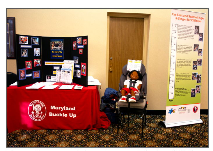
Information from partners in highway safety were on display during the Highway Safety Summit.