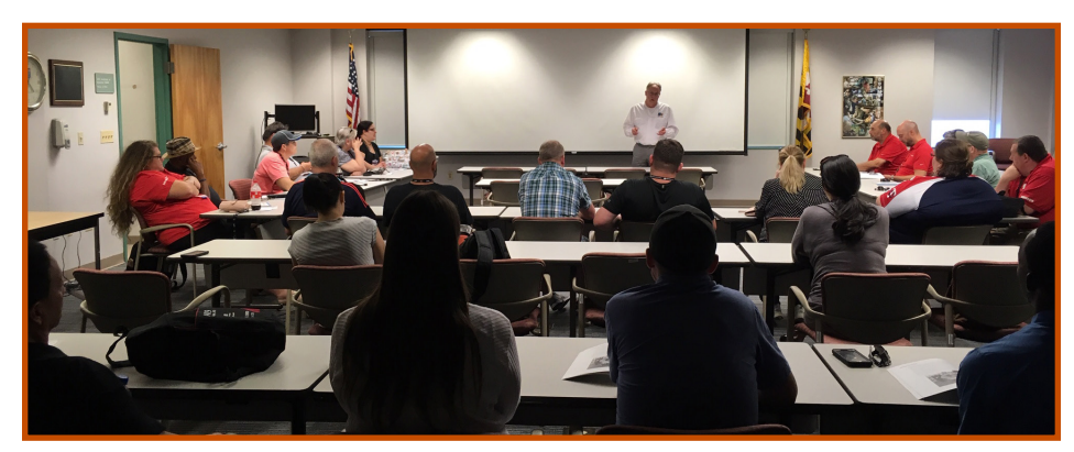
Attendees received an overview of the Maryland EMS System and information on how EMRC and SYSCOM operate before going to the Communication Center at MIEMSS.

APCO 2019, which is APCO International's Annual Conference and Expo, was recently held in Baltimore from August 11- 14, 2019. The event was designed for public safety communications officials, from frontline telecommunicators to communication center managers to public safety communications equipment and services vendors. APCO 2019 offered four days of educational sessions, com-