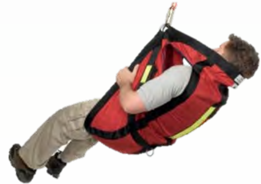
Air-Lift Rescue Vest (ARV)

On October 8, 2023: Trooper 7 was dispatched to the area of Taylor's Island in Dorchester County at 0040 hours for a subject on a boat that had run aground. The fire department stated they received the call around sunset and were initially having trouble finding the victim. Trooper 7 located the victim but the ground units were unable to get to the victim. At 0123 hours, Trooper 2 was dispatched with its crew and aircraft prepped to complete the hoist. Trooper 2 utilized an Air-Lift Rescue Vest (ARV) to safely hoist the victim onto the aircraft. Patient care was transferred to the medic unit for evaluation.